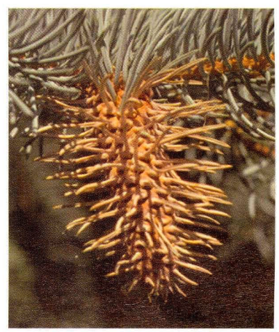
Figure 1: Gall on blue spruce.

Cooley spruce galls are conspicuous and frequently cause considerable concern to homeowners. However, the galls usually do not cause any serious harm to the tree. Extremely heavy infestations may cause minor retardation of tree growth and some distortion. However, in most cases, old galls are covered by new growth the following season and become almost unnoticeable a few years after they form.