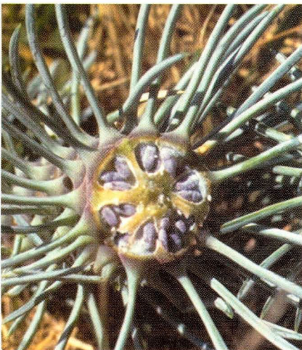
Figure 3: Gall cross-section showing developing insects.

1 Colorado State University Cooperative Extension entomologist and professor, bioagricultural sciences and pest management.