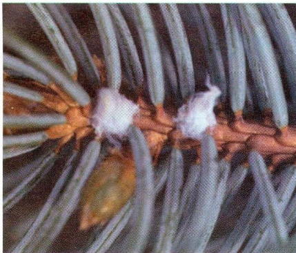
Figure 2: Overwintered females.

Always read and follow mixing and usage instructions on the label. Direct applications against the overwintering insect, preferably before egg production has begun. Treatments usually are best made during warm periods in fall (mid-October or November) or in late March through April.