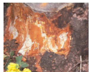
Figure 3: White fungal fans of Armillaria spp.

Armillaria spreads along roots and by rhizomorphs (fungal-root-like structures). One tree or a group can be attacked. The fungus can subsist on dead, woody material for more than 35 years. Armillaria prefers to infect trees that are already stressed by environmental factors or other pathogens. It prefers moist sites and moderate temperatures and is rarely found on extremely hot, cold or dry sites.