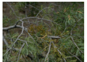
Figure 2: Dwarf mistletoe broom and plants.

These are small, leafless, parasitic flowering plants that grow on branches and spread only to other pinyon pines. They kill slowly by robbing the tree of its nutrients and water. Reproduction occurs when sticky seeds explosively discharge from the plant and adhere to the branches and needles of their next host. The life cycle from germination to dissemination is six years. This relatively slow rate of spread allows time for appropriate action.