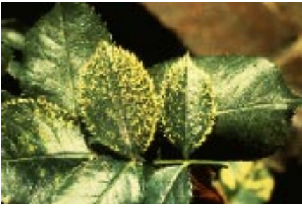
Figure 1: Symptoms of rose mosaic virus.