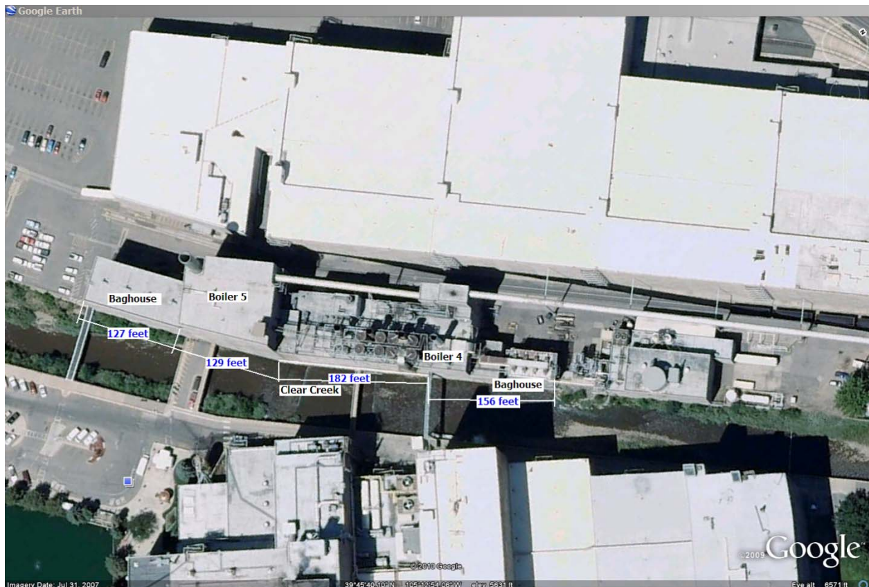
Figure 2: Aerial Zoom of CENC Facility

DSI: Dry sorbent injection involves the injection of typically a sodium based reagent, either the mineral trona (sodium sesquicarbonate) or refined sodium bicarbonate, into the flue gas. The injected reagent reacts with the \text{SO}_2 present in the flue gas to create sodium sulfate, which is then collected in the particulate control device, in the case of CENC. CENC asserts that the flue gas temperatures present upstream of the boiler airheaters are in the appropriate range to allow for DSI application. A very important factor in DSI application is the ability for the boiler's particulate control device to accommodate the added particulate loading of the DSI reagent in addition to the flyash loading. CENC's preliminary review indicates that even with the added loading of DSI reagent, the CENC baghouses would be operating within the design specification for particulate loading, but the ash collection system(s) would require modifications. The flue gas is not cooled nor saturated with water, so reheating of desulfurized flue gas is not required. No gas-sorbent contacting vessel is required to be installed. DSI requires less capital equipment, less physical space, and less medication to existing ductwork compared to a SDA system.