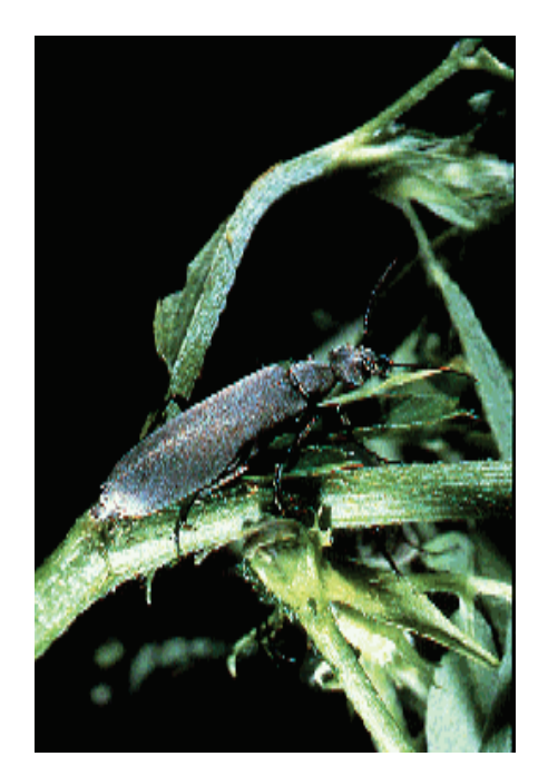
Figure 2: E. fabricii , a blister beetle common in June in Colorado.

associated with grasshopper outbreaks. Consequently, alfalfa grown near rangeland has a greater likelihood of blister beetle infestation.