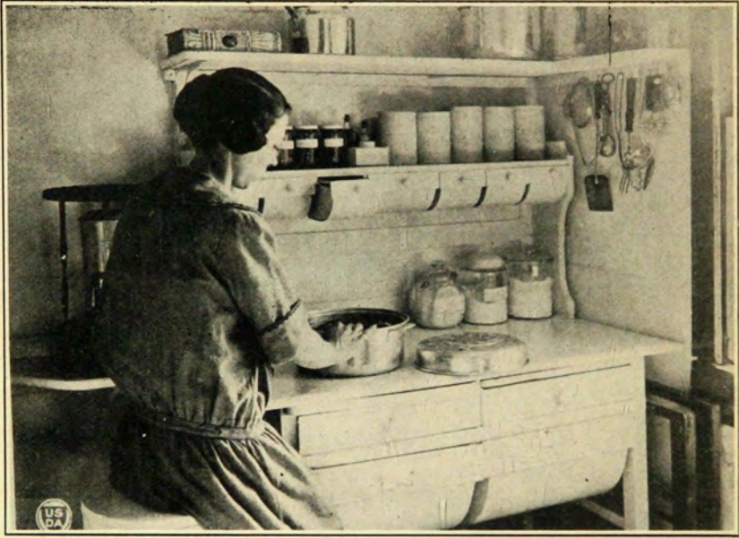
An Easy-to-Clean Cabinet