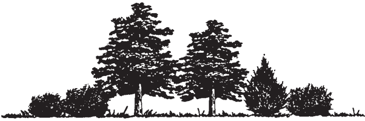
Figure 2: Ladder fuels enable fire to travel from the ground surface into shrubs and then into the tree canopy.

variety of textures and color and help reduce soil erosion. Consider ground cover plants for areas where access for mowing or other maintenance is difficult, on steep slopes and on hot, dry exposures.