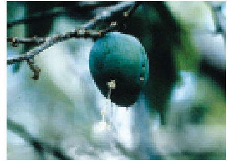
Figure 4: Oozing from plum gouger feeding wound.

Effective controls have not been identified for these insects. They will often drop from plants when disturbed, so some beetles can be collected by shaking branches over a sheet during blossoming and fruit set. Fruit tree “cover sprays” applied before and after bloom should also control them.