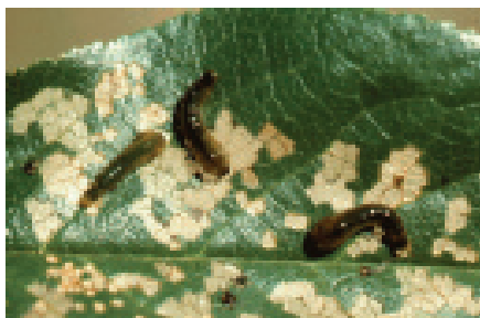
Figure 6: Pear slug larva and characteristic feeding injury.

Effective controls have not been identified for these insects. They will often drop from plants when disturbed, so some beetles can be collected by shaking branches over a sheet during blossoming and fruit set. Fruit tree “cover sprays” applied before and after bloom should also control them.