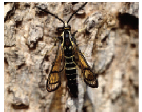
Figure 2: Peach tree borer adult male.

Colorado State University Cooperative Extension