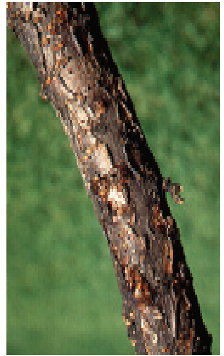
Figure 7: Shothole borer exit holes.

Occasionally, preventive insecticide sprays are useful to help manage outbreaks of shothole borer. Certain formulations of carbaryl (Sevin), permethrin and esfenvalerate can be used on branches to control borers in stone fruits. Apply them in late spring to coincide with periods when the adults emerge from the twigs in which they developed during the winter. A second generation of beetles emerges in midsummer.