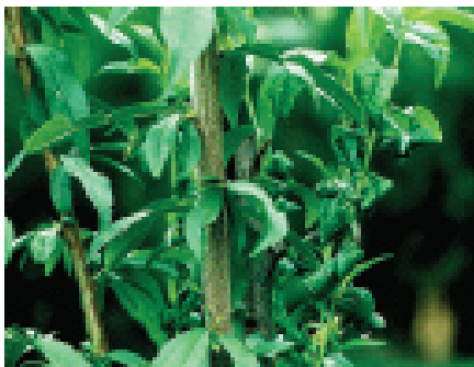
Figure 3: Leaf curling of peach.

Two species of weevils or snout beetles damage stone fruits, particularly along the Front Range. The cherry curculio ( Tachypterellus consors ssp. cerasi ) attacks sour cherries and chokecherry. The plum gouger ( Anthonomus scutellaris ) is particularly common in the hard European plum varieties. Both insects spend the winter in the adult stage around the base of previously infested trees. In spring, about the time blossoming occurs, they move to the trees and feed on the buds and flowers. Later they feed on small fruit, producing puncture wounds. Wounded plums typically ooze sap. Eggs are laid in some of the fruit and the young beetle grubs develop on the pit of the fruit.