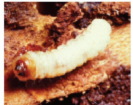
Figure 1: Peach tree borer larva.

Preventive sprays of insecticides, applied to coincide with periods when