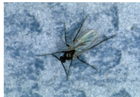
Figure 1: Fungus gnat adult.

Adults are 1/8 inch long, delicate, black flies with long legs and antennae. There is a distinct “Y-shaped” pattern on the forewings. The larvae are worm-like and translucent, with a black head capsule, and live in the growing medium of houseplants.