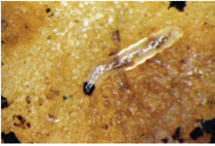
Figure 4: Fungus gnat larvae on potato slice.

The larvae in the growing medium will not be directly affected by any insecticides applied to kill adults. An alternative approach to deal with fungus gnat adults, particularly when populations are abundant, is to strategically place yellow sticky cards (sold as Gnat Stix) underneath the plant canopy or on the edge of containers. The adults are attracted to yellow and will be captured on the sticky cards. This may be helpful in mass-trapping adult females, thus reducing the number of larvae in the next generation.