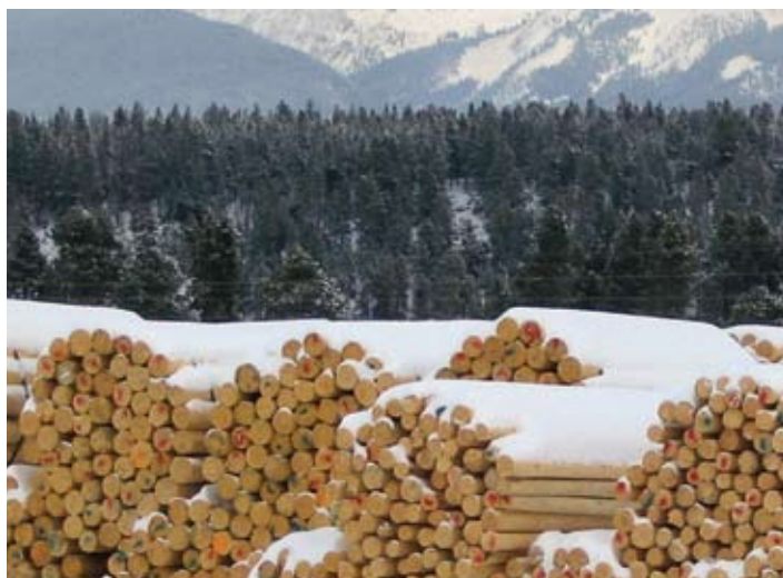
A strong forest industry is essential to help offset the cost of treatments necessary to develop and maintain the diverse forest structure desired in the wildland-urban interface.