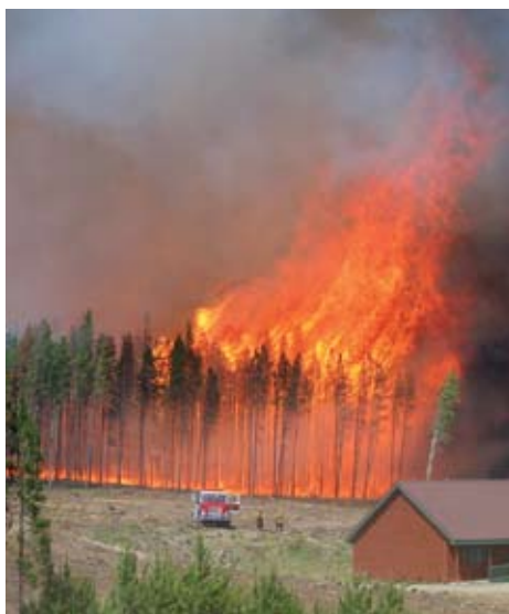
The 2007 Y Fire in Grand County occurred in MPB-impacted stands of lodgepole pine.

pine beetle epidemic on this scale. In pure lodgepole pine forests, crown fires are possible before and after an epidemic while needles are still on trees. Intense surface fires are possible after most dead trees have fallen to the ground. The probabilities of such fires are uncertain, and more research is needed to determine in what ways and how long the fuels and fire environment are altered by the beetles. Nevertheless, protecting communities and other values at risk is imperative.