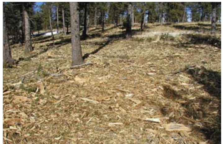
Grinding and mulching slash, called mastication, is an effective way to treat debris after thinning or other harvest methods. Avoid excessive depth or accumulation of chips and chunks.