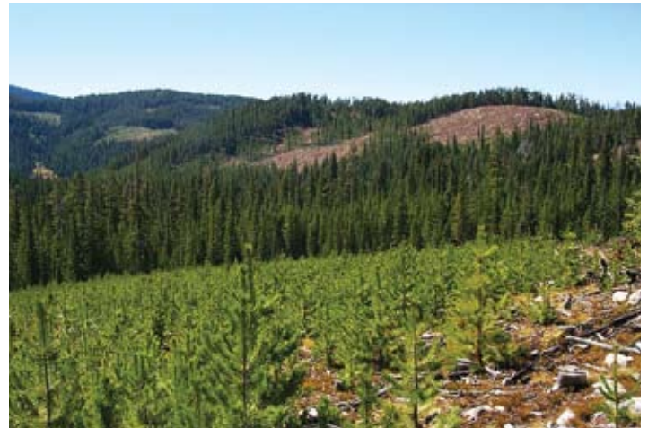
In the WUI and surrounding areas, lodgepole pine should be intensively managed beginning at an early age; see photo of a regenerated stand, above. Doing so will help prevent the development of overly dense, stagnated stands of trees, as shown in the photo below.