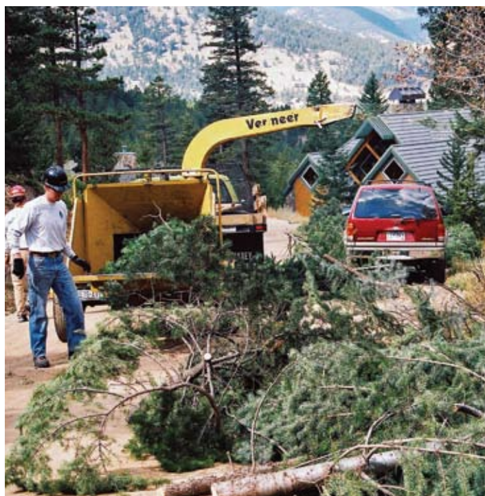
Chipping is an effective method of slash disposal, but it is very labor-intensive and expensive.