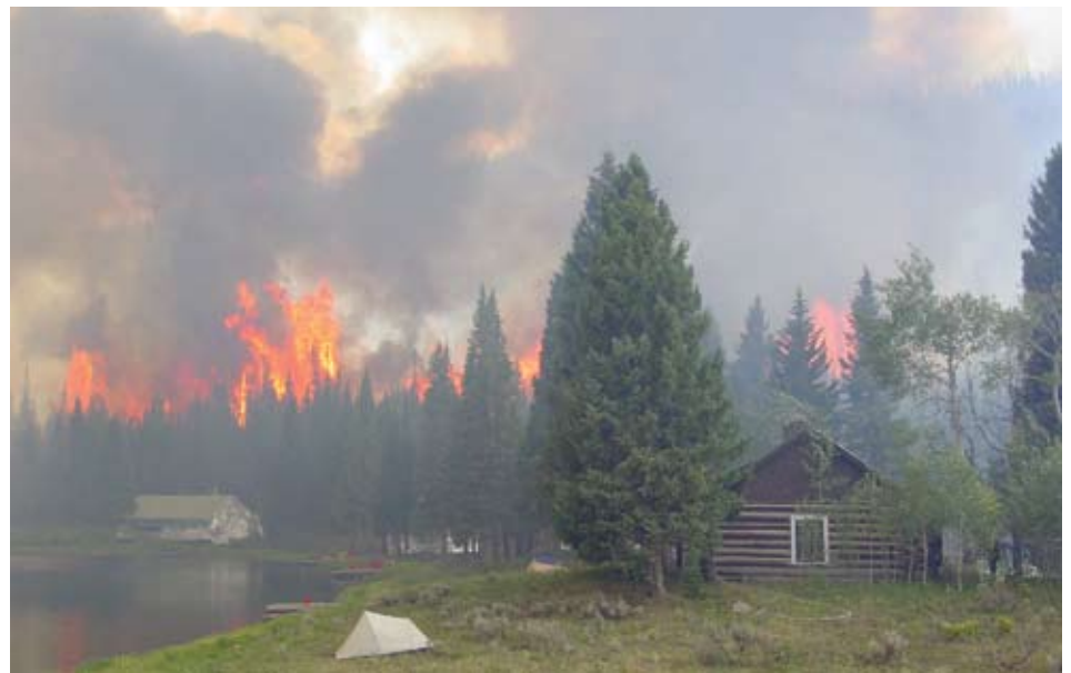
Fire hazards to communities are complicated and change over time when mountain pine beetles are added to the equation.

has increased dramatically. Homes, businesses, and subdivisions are being built on forested lands that historically and regularly have experienced fires. Wildfires in Colorado are a natural part of our ecosystems and often help restore and maintain healthy forests. In order to preserve human life and property, firefighters have worked hard to suppress and control fires; however, this may have had negative effects on some ecosystem functions.