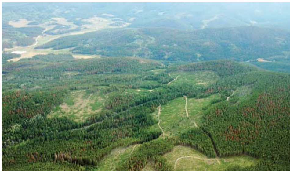
A rapidly building beetle population begins to overtake an area before all regeneration targets can be completed.

Considerable uncertainty exists about fire behavior following a mountain