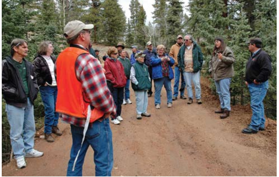
Land managers and local residents must work hard to come to consensus on the community's sense of place, and management techniques and treatments.

As land managers, we usually are not well trained or equipped in the social aspects of working with communities. For the most part, we admittedly are uncomfortable in the role of defining a community's sense of place. However, we strongly encourage communities to carefully consider their sense of place — the values they share that make their community a true home — when defining their interface area.