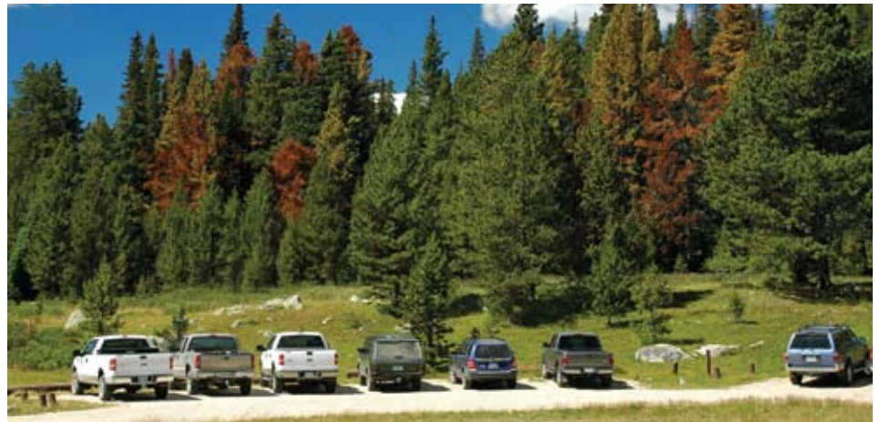
Pockets of mountain pine beetle begin to spread through an unmanaged forest.

■ Not all lodgepole pine forests are the same. Some forests are composed of pure lodgepole pine that was established following large fires that occurred decades or even centuries ago. Others are mixed with