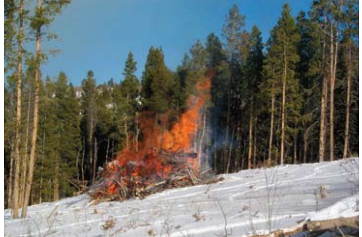
Careful burning of slash piles during periods of adequate snow cover or moisture is an effective method of disposal.