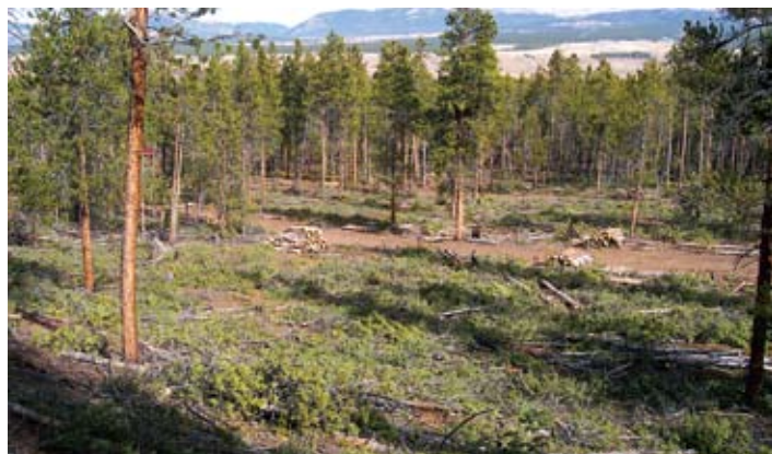
Lop and scatter slash with care and under limited circumstances within the wildland-urban interface.

d. Even where a market for sawlogs exists, removing only infested trees will result in a net cost for the landowner.