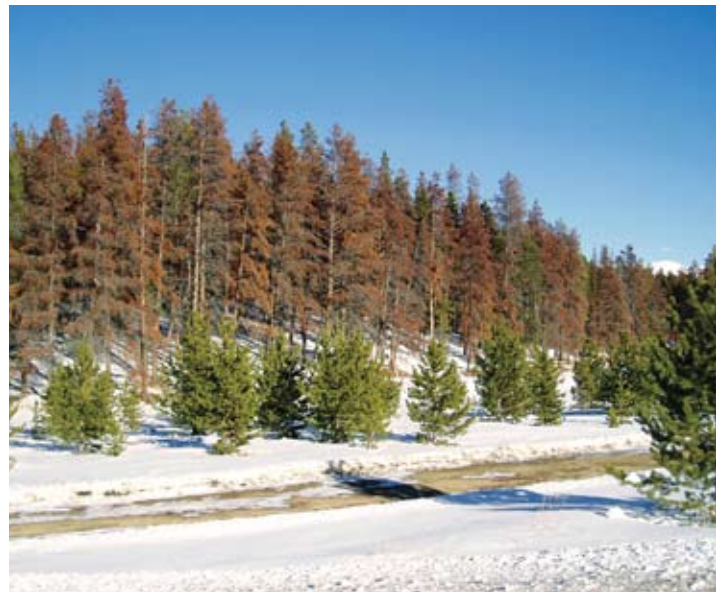
During the most recent MPB epidemic, some areas have experienced nearly 100-percent mortality of larger trees.

For example, Denver Water actively managed its forest stands in Grand County for many years prior to the current beetle epidemic. Stands were thinned in many areas and dwarf mistletoe-infected stands were clearcut and regenerated, as were some larger, older stands. This treatment strategy resulted in stands of trees that are too small and/or vigorous for the beetles to successfully attack. Larger trees in thinned stands responded to thinning in varying degrees, making them more resistant to beetle attacks. These were some of the very last stands in the area to succumb to the beetle. Stand life was marginally extended as a result of the thinning. If the epidemic had been less intense, it is likely that many of these trees might have survived. In addition, these managed stands existed for many years in the absence of wildfire hazards due to improved understory vegetation. Further benefits included wildlife habitat, aesthetics, and other values.