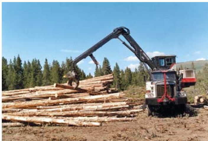
If lodgepole pine can be harvested prior to or soon after attack by beetles, it may be usable for many different forest products.