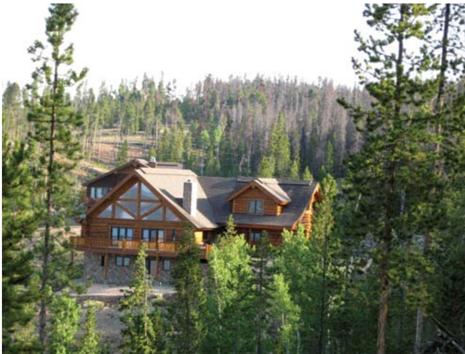
Intensive management over time is necessary to better maintain forest cover during periodic insect and disease outbreaks or other disturbances.

It is important to recognize that the most effective way to achieve the greatest increase in the safety of homes is to ensure that structures are built with materials that are fire resistant or noncombustible, and to thin, prune, and otherwise modify the forest and fuels immediately adjacent to and surrounding structures. Treatments generally should occur around and close to structures and communities first, and then move outward. However, it is understood that a community's CWPP specifically defines treatment areas, treatments to be applied, and their relative priority.