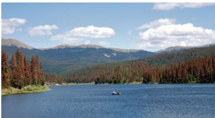
MPB -impacted lodgepole pine stands near Michigan Reservoir.

Much of Colorado's lodgepole pine forests are at risk from attack by mountain pine beetle. Extensive areas in Grand, Summit, Jackson, and other counties have been under