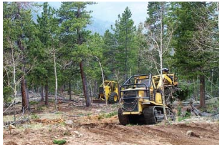
Where markets for timber do not exist or trees are too small, equipment can grind, mulch, or masticate trees to accomplish desired treatments.