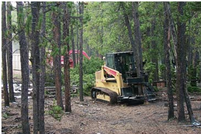
Within the WUI, thinning of lodgepole pine should be carefully undertaken at any age to protect homes and other enhancements, and to improve forest health.