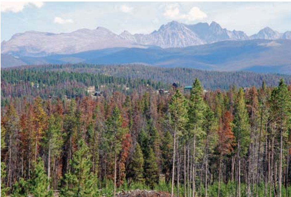
During the current epidemic, beetles have killed most trees over a number of years as shown by the mix of grey, red, and green trees.