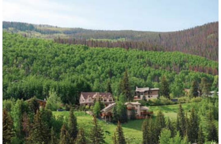
In lodgepole pine forests, it often is possible and desirable to convert to, and maintain some areas as, aspens stands.