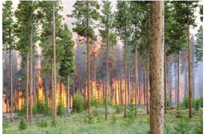
Even areas of lodgepole pine that have been thinned can burn intensively during warm, dry, and windy conditions.