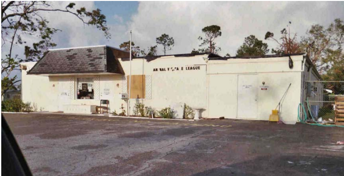
Figure 2: The Animal Rescue League of Charlotte County.