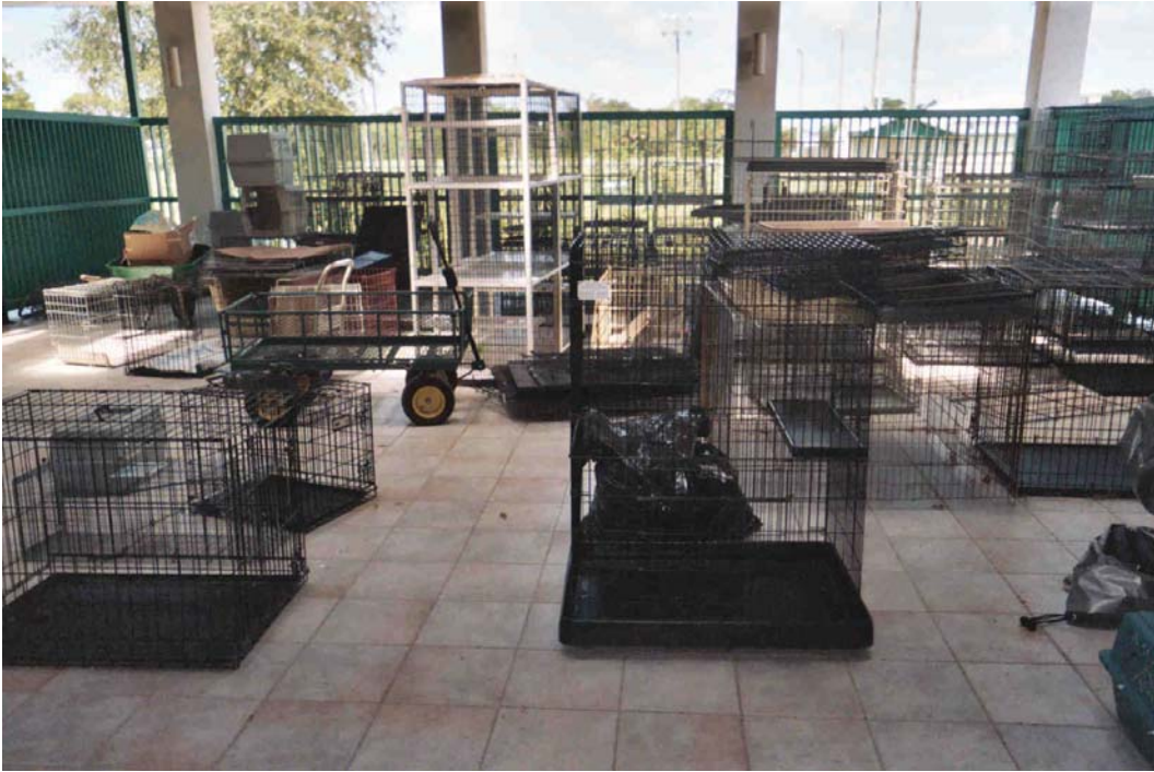
Figure 5: Crates stored at the Suncoast Humane Society.