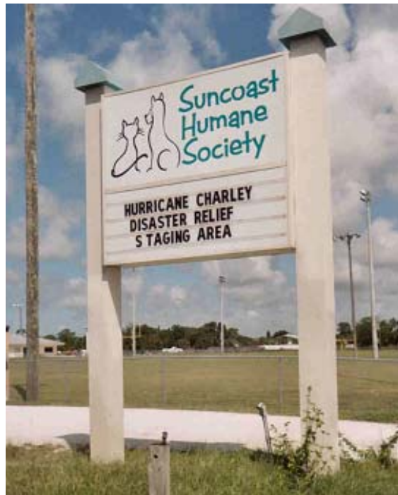
Figure 4: The Suncoast Humane Society served as staging area for lost and rescued animals.