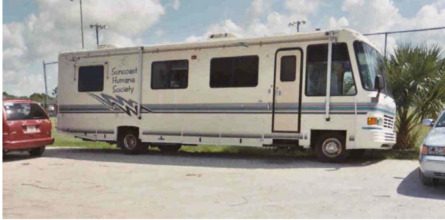
Figure 3: Mobile adoption vehicle used for transporting animals.