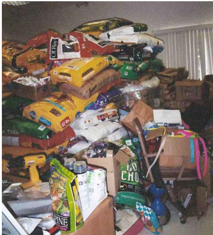
Figure 6: Some of the donated food and supplies.