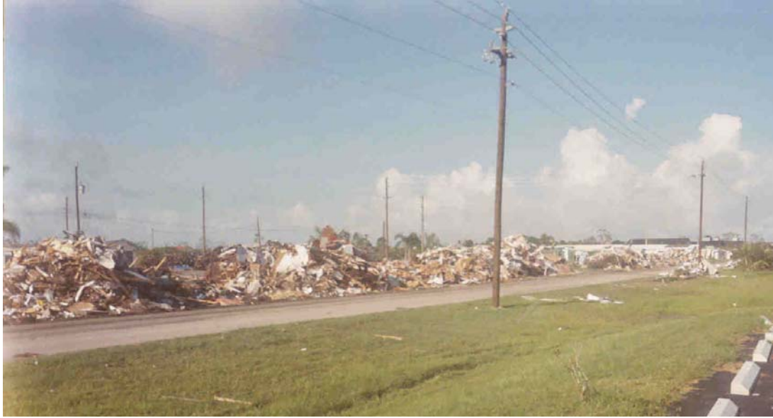
Figure 1: Debris lining a residential area in Punta Gorda.