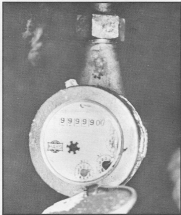
The functional dials of a water meter, when translated into dollars and cents of cost, can reduce the amount of water demanded by a residence.

The consumer can affect lawn water usage through alternative horticultural practices. The use of native species of plants and landscaping techniques can reduce sprinkling requirements. Installation of improved sprinkling equipment, drip irrigation systems, and carefully controlled irrigation utilize the available water more efficiently.