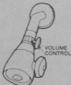
SHOWER HEAD WITH VOLUME CONTROL