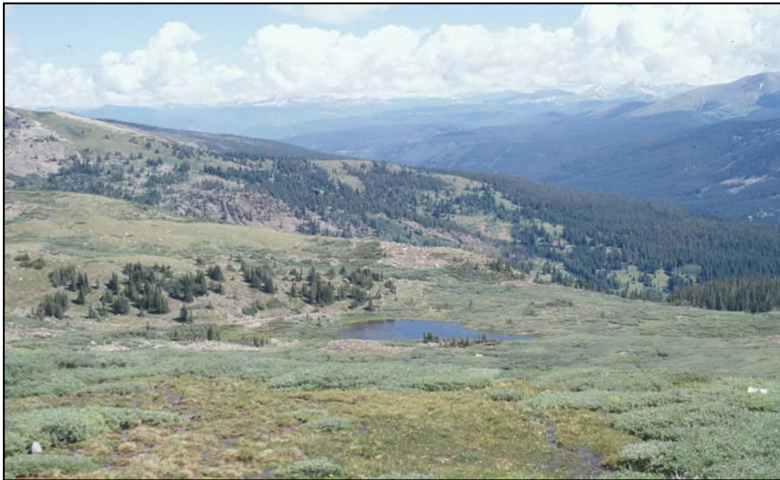
Figure 2. Habitat for Parnassia kotzebuei is found along this lake shore.

1989, Spackman et al. 1997a). Several State Heritage Programs and Conservation Data Centers outside of Region 2 have ranked this species (NatureServe 2004). Parnassia kotzebuei is ranked imperiled (S2) in Idaho, critically imperiled (S1) in Washington, vulnerable (S3)