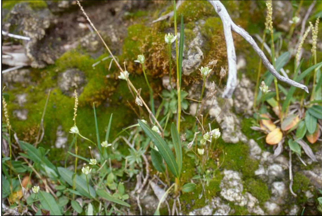
Figure 1. Close-up photograph of plants and microhabitat for Parnassia kotzebuei .