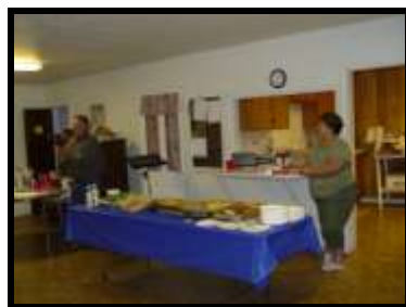
Preparing to enjoy a great meal.

In honor of 9/11 Remembrance Day, the Saguache United Methodist Church AmeriCorps program collaborated with the Saguache County Sheriff's department, VISTA members, Mountain Valley High School and the Oasis Restaurant to produce a recognition dinner for Saguache County's first responders. The dinner was enjoyed by over 60 volunteers and family members of the Saguache Volunteer Fire Department, first responders and ambulance crew on 9/8. Volunteers were presented with the Presidential Volunteer Service Awards, which included 21 (out of 48) lifetime awards to volunteers who have accumulated over 4,000 volunteer hours.