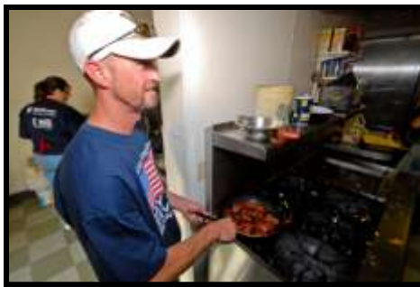
Cooking up breakfast.

Ten Xcel Energy volunteers cooked and served breakfast to 40 residents of Urban Peak for the 9/11 Day of Service. Volunteers served a delicious breakfast that consisted of waffles, scrambled eggs and many more breakfast foods. Urban Peak is a shelter for 15-21 years old homeless youth. The residents of Urban Peak are offered a supportive community that empowers them to become self-sufficient adults.