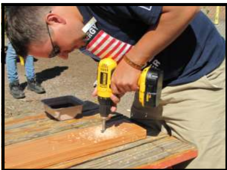
Building the bench.

The Bridge Project's mission is to provide educational opportunities for children living in Denver's public housing neighborhoods so they graduate from high school and continue on to higher education. Xcel Energy volunteers and students from the Bridge Project sanded and prepped a bench in the garden and then painted a mural on the bench. The kids enjoyed the hands-on project knowing they would be able to show their friends all the hard work they did.