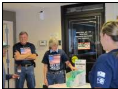
Explaining the benefits of CFL.

Xcel Energy volunteers passed out over 500 compact fluorescent light bulbs (CFL) to the senior and disabled residents of the Volunteers of America Sunset Park Apartment Complex. Volunteers assisted in the installation of the light bulbs which will save over 75% in energy costs and will last 10 times longer than a regular light bulb. The residents were very appreciative of all the volunteers efforts.