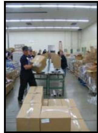
Packing cartons of food!

The Food Bank of the Rockies receives and distributes tens of millions of pounds of food annually to over 1,000 hunger-relief programs. On September 10, a terrific team of 34 Xcel Energy volunteers helped Food Bank of the Rockies pack 750 cartons with food staples to supplement daily nutrition needs. The boxes of food will make a real difference in the lives of hundreds of families and individuals. The team's hard work and great spirit was a fitting way to honor the victims and emergency responders of 9/11 and to fulfill Food Bank of the Rockies' mission of fighting hunger and feeding hope.