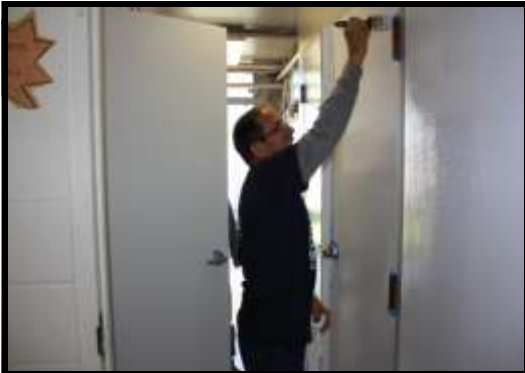
A volunteer spruces up a door.

The mission of Mile High Montessori Early Learning Centers is to provide quality early childhood education to low-income children to prepare them for school.