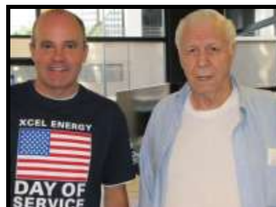
Assisting one of the residents.