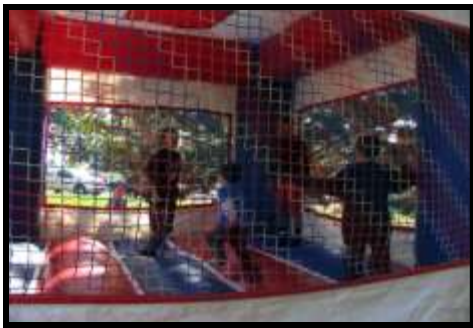
Children enjoy the bouncy castle.

Twenty Xcel Energy volunteers spent the morning at the Denver Bronco's Boys and Girls Club preparing and serving breakfast to club members and their families. A carnival with games, prizes and lots of activities was also available. Over 200 parents and kids attended the exciting family day.