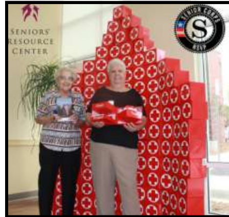
Preparing disaster preparedness kits.

Senior Resource Center kicked-off a Disaster Preparedness for Seniors Project on 9/11 dedicated to the memory of 9/11 first responders. Volunteers are working directly with seniors on completing an individualized written home evacuation plan, completing an emergency contact file and receiving disaster preparedness kits. 150 seniors will benefit from the program. Senior Resource Center works diligently to enhance the quality of life for seniors and the RSVP Program of Jefferson County has been an integral part of the organization for the entire 33 years. With 83 sites in Jefferson County, hundreds of volunteers dedicate their time and talents to help the community.