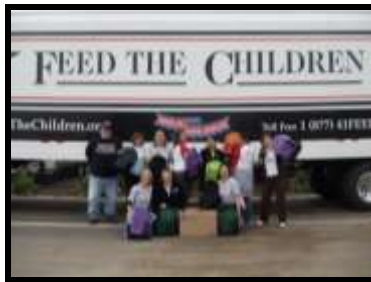
Jeffco HIPPYCorps members.

Jeffco HIPPYCorps (Home Instruction for Parents of Preschool Youngsters) in partnership with Jeffco Schools Homeless Services and the McKinney Vento program at the Colorado Department of Education, distributed over 3,800 backpacks with school supplies, books, toothpaste and food to school districts all over the state through the Feed The Children Back Pack Distribution event. The event gives homeless children the food and supplies they need to stay in school and succeed academically.