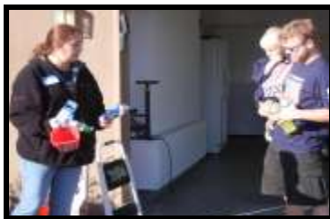
Getting ready to clean.