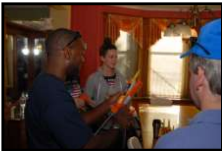
Getting ready to get to work.