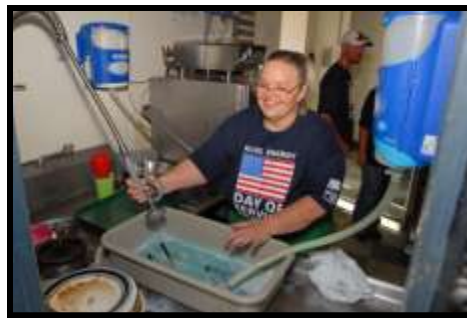
Cleaning up after a great meal.