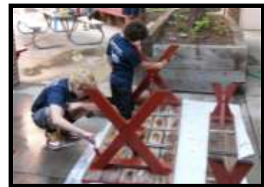
Putting on a fresh coat of paint.

The Care Center offers day programs to older adults with physical and cognitive challenges and to young adults with developmental disabilities. The Care Center provides a well-rounded program that addresses physical well-being, creative endeavors, social connections, mind challenges and spirituality.