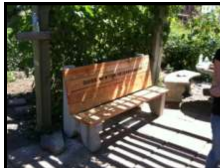
The bench sanded and ready for paint.