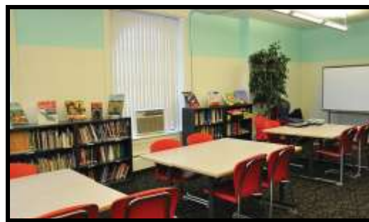
The freshly painted classroom.