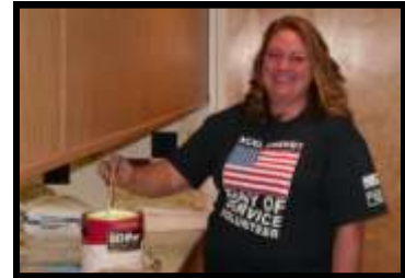
Getting ready to paint.

To honor the 9/11 Anniversary, 12 Xcel Energy volunteers worked at the Senior Resource Center Adult Day and Respite Care Center which was in need of sprucing up. The volunteer employee team painted courtyard benches, did general yard work, planted flowers, painted the kitchen and cleaned and lined the kitchen shelves.