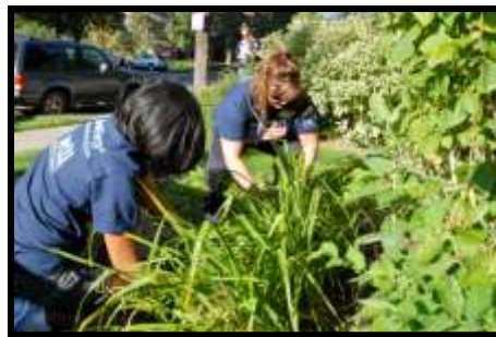
Weeding and mulching.

Xcel Energy volunteers spent the day working at Warren Village weeding and mulching the community's gardens and repairing the outside stairs. Warren Village helps motivated, low-income, previously homeless single parent families move from public assistance to personal and economic self-sufficiency. Warren Village completed a major renovation to the community in May 2011, and the work done by Xcel will brighten up the exterior of the buildings for its residents.