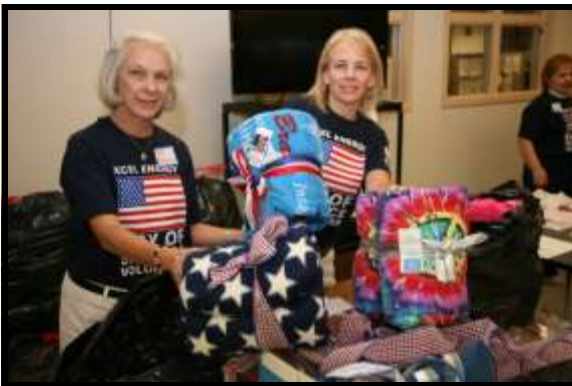
Packing the fleece blankets to donate.

Fifty-five Xcel Energy employees and family members honored the 9/11 Anniversary by gathering in Denver to make 160 fleece blankets in a little more than three hours. Thanks to these energetic volunteers, clients of the Colorado Gerontological Society will receive these warm, colorful blankets with their holiday gift baskets this year.