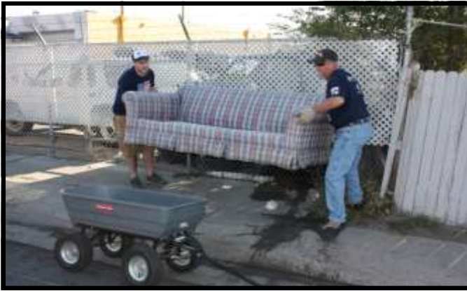
Volunteers load a couch for removal.