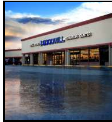
Denver's Goodwill Donation Center.

For over 90 years, Goodwill has provided training and employment to unemployed, low-income and disabled adults in Denver. Goodwill's retail stores provide affordable clothing and household items, create employment opportunities (on average 70% of retail employees are disabled or have other barriers to employment) and generate revenue toward achieving Goodwill's mission. Nine Xcel Energy volunteers assisted at the Denver retail location by taking in, sorting, and placing donations on store shelves. Contributing in this manner has a real impact to Goodwill as income from their retail stores are the primary source of funding for their programs.