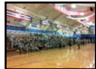
The Warrior Transition Unit

The Center for Technical Assistance and Training (CTAT) at Denver Options recognizes and honors the large number of veterans who have served our country. In order to help veterans connect to national and community service in Colorado, CTAT created a “Veterans AmeriCorps Quick Reference Guide” which supplements the existing “Veterans and Community Service: What’s In It For Me? (WIIFM)” Veterans Outreach Program training sessions . The guide highlights national service by including information such as the benefits of national service as a transition to civilian employment. The guides will be distributed to attendees of the Veterans Outreach Project sessions at Ft. Carson and Denver Options, and to Denver Options Program Managers who work directly with veterans in Fort Carson, Colorado Springs and Denver.