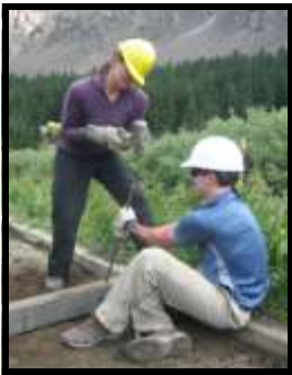
Volunteers pound in new check dams.

Volunteers for Outdoor Colorado partnered with the Colorado Fourteeners Initiative to restore the popular trail leading to Grays and Torreys Peaks. Forty-five hardworking volunteers spent two days moving 58 tons of rocks and crusher fine to restore a 600 foot section of trail. These trail improvements will prevent erosion and protect this fragile alpine area, allowing the thousands who hike the trail each year to enjoy Colorado's beauty while sustaining it for generations to come. The weekend was topped off with delicious food, camping, great company, and a beautiful setting.