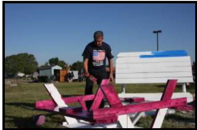
An Xcel Energy volunteer sprucing up an old bench.

The Boys and Girls Club families were very thankful for everything that was done to improve the facility and were grateful to the Xcel Energy employees who were so giving of their own personal time.