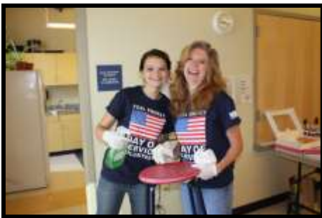
Helping give Girls Inc. a new sparkle.

Fifteen Xcel Energy employees volunteered at Girls Inc. on September 10 in commemoration of the 10 year anniversary of 9/11. Volunteers helped prepare the facility for the upcoming school year by working on landscaping, sorting books and sports equipment, cleaning the gymnasium and sprucing up their transportation vans. Since its founding in 1945, Girls Inc. empowers girls and strives for an equitable society. Girls ages 6-18 are taught to have confidence in themselves and to be prepared for interesting work and economic independence.