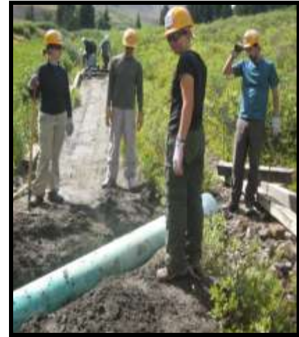
Installing a culvert.

Volunteers for Outdoor Colorado partnered with the Colorado Fourteeners Initiative to restore the popular trail leading to Grays and Torreys Peaks. Forty-five hardworking volunteers spent two days moving 58 tons of rocks and crusher fine to restore a 600 foot section of trail. These trail improvements will prevent erosion and protect this fragile alpine area, allowing the thousands who hike the trail each year to enjoy Colorado's beauty while sustaining it for generations to come. The weekend was topped off with delicious food, camping, great company, and a beautiful setting.