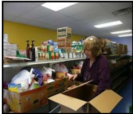
Putting donations on the shelves.

The organizational mission of Sister Carmen Community Center (SCCC) is to provide assistance, without discrimination, to residents of East Boulder County who are in need. Volunteers sorted gently used donations and put items on the shelves of their thrift store. SCCC depends on thrift store revenues to help provide the basic needs of housing, food and self sufficiency.