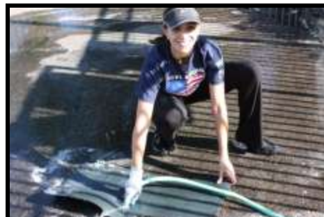
Cleaning off mats outside.