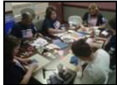
Organizing the supplies.

Volunteers also put their creative hats on to design one-of-a-kind cards which were attached to each backpack to add a more personal touch. Children will receive these backpacks at their first meeting with the advocates.