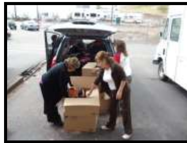
Sorting through supplies.