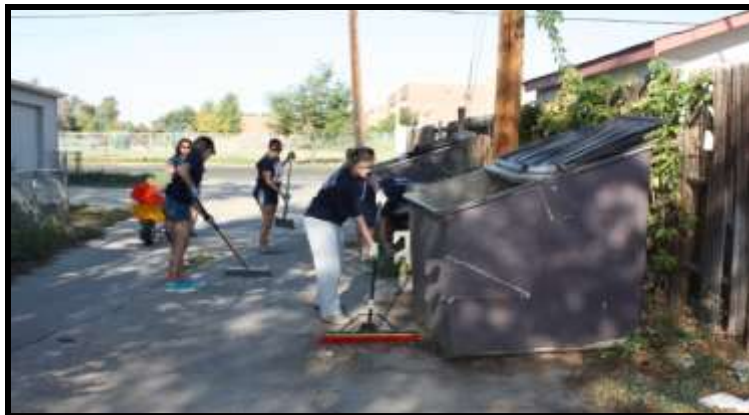
Sweeping out an alleyway.

Twenty Xcel Energy employees partnered with Extreme Community Makeover to volunteer in remembrance of September 11, also kicking off the Xcel Energy United Way campaign. Volunteers removed graffiti and cleaned up alleys in the community of Westwood. The group was able to remove truckloads of trash out of the alleys which ended up filling a 30 yard dumpster! The community was also involved as some teams had neighborhood members and children helping them out along the way.