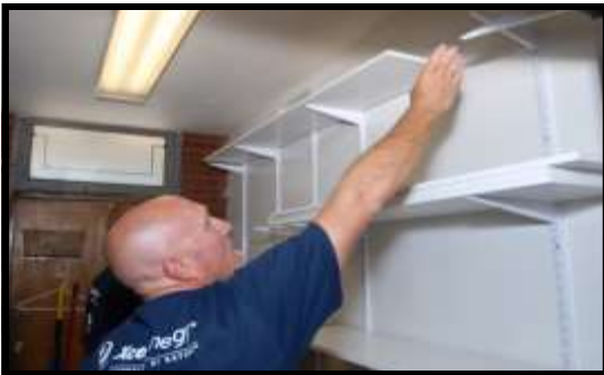
Putting up shelving in the clothing room.

Senior Support Services (SSS) was established in 1976 when six churches in downtown Denver came together to assist low-income and homeless seniors who were being displaced by downtown redevelopment. As the need grew, their services expanded. In 1995, SSS bought a building at 18th Avenue and Emerson Street where a full range of services are provided for hungry and homeless seniors. Xcel Energy volunteers helped polish up the building by meticulously deep-cleaning the computer area and painting shelving for the clothing room. Now both rooms have a new glow!