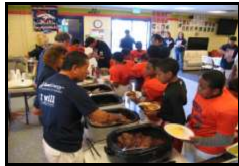
Volunteers help serve breakfast.