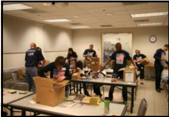
Working together to package donated books.

Twenty-seven volunteers in various Xcel Energy Colorado locations helped collect brand new books for children up to 11 years of age who live on military bases. The book drive took place from August 15-26; on September 10, volunteers sorted and packed all of the donations. The book drive was a huge success with 1,069 books collected from the generous donations of the community.