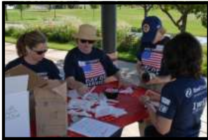
Organizing picnic supplies.

Work Options for Women was founded in 1996 with a mission to combat homelessness and poverty by providing unemployed women with the confidence and skills they need to become gainfully and permanently employed in the food service industry. Work Options for Women students participate in a 16-week hands-on food service training alongside professional chef instructors. Xcel Energy volunteers sponsored a picnic for current and former program members. Everyone enjoyed a fun afternoon and a delicious picnic.