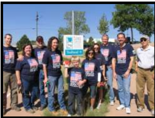
The volunteers pose for a group photo.

Fifteen Xcel Energy volunteers planted shrubs and plants along the Sand Creek Regional Greenway in Commerce City. This area had recently flooded, and the plants and shrubs will be critical to restoration efforts. The Greenway was named one of the Top Ten Fitness Trails in the USA by The American Hiking Society. The volunteer's hard work will allow users to continue to enjoy the trails.