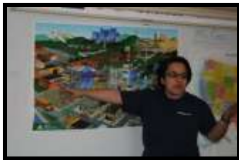
Teaching at the school.