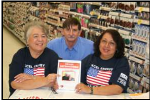
Passing out literature to the community.

In partnership with Walgreens, 12 Xcel Energy volunteers helped screen individuals for eligibility for senior programs such as LEAP (heating assistance), food stamps, tax rebates, telephone assistance and prescription drug assistance. Volunteers also handed out the Senior Resource Guidebook, a comprehensive guide to senior resources in the Denver metro area.