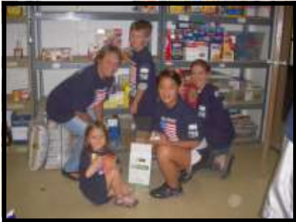
Taking a break from stacking the shelves.

Over 3,300 pounds of food were collected by 80 employees of the Fort Collins and Greeley Xcel Energy Service Centers in an eight-week, 9/11 food drive. On 9/11, these employees and families delivered the donated food and helped sort and stack the shelves of the Windsor Food Pantry. The shelves of the food pantry were close to empty when the volunteers arrived yet, completely full by 11:30 a.m.! The need for food is great as 1-in-8 people in Colorado experiences hunger. The volunteers were grateful that due to their efforts, fewer people will have to go hungry in Windsor.