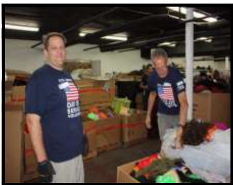
Volunteers sort donations.

Nine Xcel Energy volunteers and family members partnered with the Boulder Goodwill store on September 10. While some volunteers organized the outdoor large item area, others helped out in the store sorting clothes and other goods. Goodwill provides the opportunity for tangible skill acquisition for at-risk youth and low-income and disabled adults. The in-store volunteer efforts by Xcel Energy employees helped the retail store save $300 in payroll expenses that can instead go to their programs. Many Xcel Energy employees support those programs as well by volunteering their time for mock interviews, panel discussions, and other events.