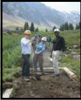
Clearing the trail.