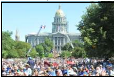
The crowd gathers to watch the program.