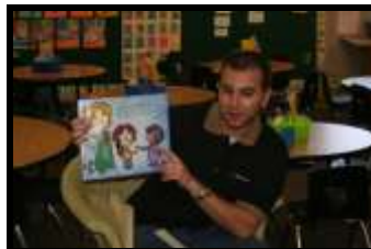
Reading with students.

Twenty-five Xcel Energy employees adopted Redstone Elementary School in Highlands Ranch to teach “JA in a Day” to over 680 students. Each volunteer taught in one classroom for the entire day and even enjoyed lunch with their students in the cafeteria. Junior Achievement trains business people to teach interactive lessons in financial literacy, work readiness and entrepreneurship to K-12th grade students. JA in a Day teaches the same curriculum as the traditional program, only rather than one lesson a week, the lessons are all taught during one full day session.