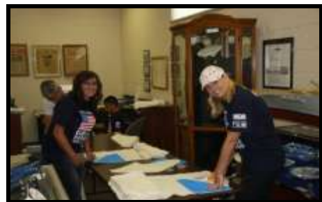
Making hangers for uniforms.