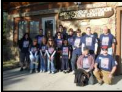
Taking a break from the repairs.

The Breckenridge Outdoor Education Center is a national leader in outdoor education serving all people with a specialized focus on serving those with disabilities and special needs. Xcel Energy volunteers spent the day repairing and painting the outdoor deck. For more than 30 years, the Breckenridge Outdoor Education Center has been changing lives by showing people that they have the power within themselves to change their own lives.