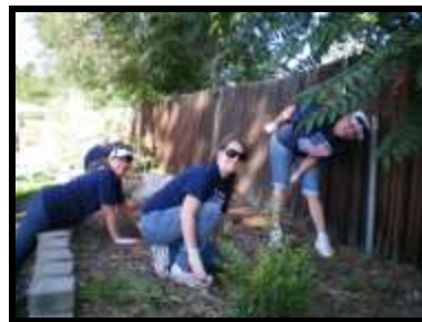
Weeding the grounds.

For 34 years, Family Tree has provided a broad range of services and shelter to families and youth of metro Denver to overcome child abuse, domestic violence and homelessness. To commemorate the 9/11 Anniversary, 12 Xcel Energy volunteers worked hard to spruce up the playground area, lay rubber mulch, trim bushes and plants, sweep sidewalks, rake, and prepare the grounds for winter. Their hard work created a beautiful new landscape at Family Tree!