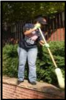
Sweeping off a retaining wall.