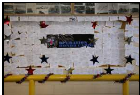
Letters to our soldiers.

As part of Operation Write Home, 15 creative Xcel Energy volunteers colored letter templates for members of the military. The coloring of each letter was as varied and creative as the messages to the soldiers within them. The hope is that these messages convey the sense of gratitude each writer feels for the sacrifice made by the soldier receiving it.