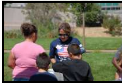
Helping with games.