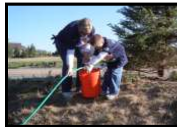
Filling up a bucket to water plants.

Boys Hope Girls Hope provides at-risk children with stable homes, education, financial and emotional support. In Foxfield, Colorado, they have two long-term care homes where live-in residential counselors challenge and mentor youth scholars of their program. Xcel Energy volunteers performed a variety of tasks at the homes including: trimming shrubs, pulling weeds, staining a deck, scrubbing floors, organizing the pantry and helping fill out the activity calendar.