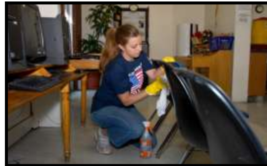
Scrubbing the back of a chair.