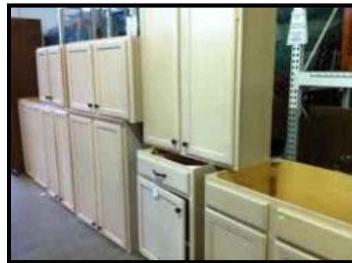
A row of donated cabinets at the store.