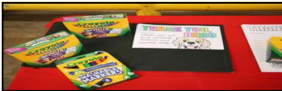
Operation Write Home thank you notes.

Twenty-seven volunteers in various Xcel Energy Colorado locations helped collect brand new books for children up to 11 years of age who live on military bases. The book drive took place from August 15-26; on September 10, volunteers sorted and packed all of the donations. The book drive was a huge success with 1,069 books collected from the generous donations of the community.