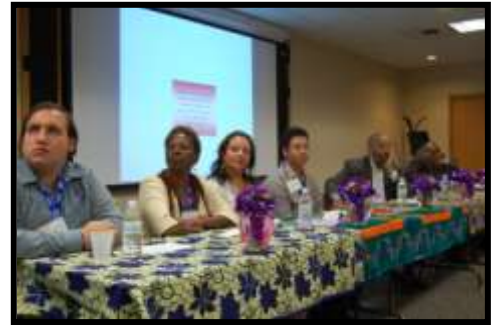
Community leader panel.