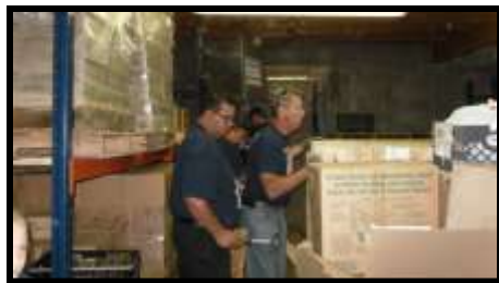
Organizing the warehouse.