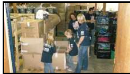
Sorting through supplies.

In honor of the 10 year anniversary of 9/11, 50 Xcel Energy volunteers supported The Action Center's donation operations by packing government subsidies for distribution , sorting and packing in-kind food donations, sorting school supplies, and assisting with the warehouse organization. The Action Center in Jefferson County provides an immediate response to the challenges residents are facing. The Action Center serves more than 28,000 residents of the county and distributes over 8,000 pounds of food weekly.