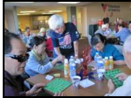
Helping with Bingo.

Over 150 people enjoyed a hearty breakfast provided by 16 Xcel Energy employees, families and friends at the Volunteers of America Day of Service Brunch on Saturday, September 10. After breakfast, guests played bingo and had a great time winning special prizes such as fleece coats and King Soopers gift cards. All guests received a special goodie bag that was filled in part with personal hygiene items. Volunteers left with grateful hearts knowing that they made each guest feel very special during the time spent together.