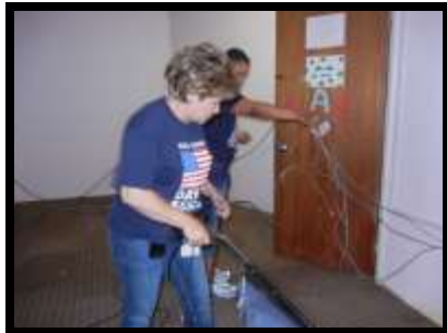
Wiring the redesigned computer lab.

Twenty-nine Xcel Energy volunteers helped to redesign and set-up the computer lab at the Bennie E. Goodwin Center. The mission of the Bennie E. Goodwin Center is to provide educational assistance to multi cultural youth and adults through educational programs, referral services and partnerships with other community organizations. Volunteers installed new electrical wiring, painted the hallways where the classrooms are located, cleaned the classrooms, resurfaced the desks and organized the food pantry.