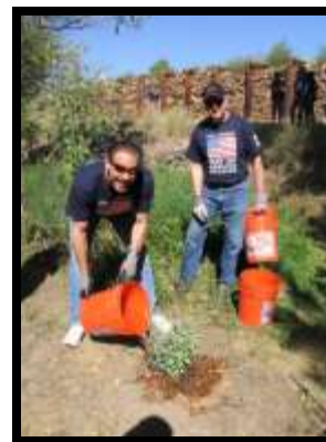
Planting and watering new shrubs.