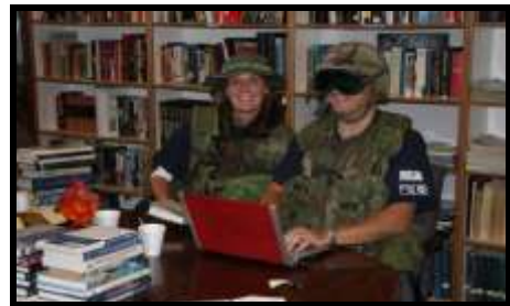
Logging books for the database.

Volunteers also helped the Museum with projects that allowed their veteran volunteers to spend more time educating the visitors through sharing their own stories and answering questions.