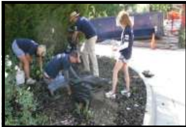
Adding a weed barrier to the garden.

Tennyson Center for Children at Colorado Christian Home serves as a treatment center and K-12 school for emotionally and crisis-affected children and youth, particularly those suffering from abuse and neglect. The organization serves children ranging in age from 5-18 and is dedicated to ensuring that these amazing kids have the fighting chance they deserve at a satisfying and fulfilling life.