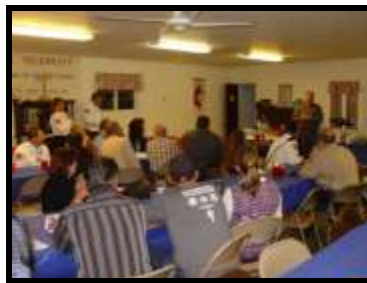
Honoring the volunteers.