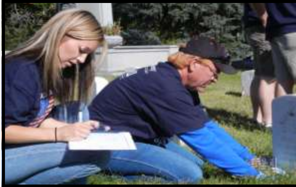
Taking inventory of the gravestones.