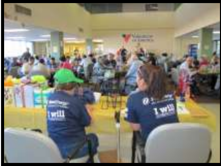
Running the Bingo hopper.