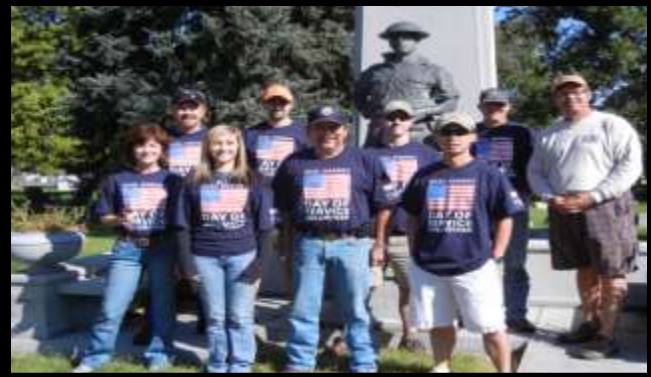
Posing as a group.

The Colorado Freedom Memorial will be the first memorial in America dedicated to all wars and all branches of service that will list the individual names and hometowns of service members. Xcel Energy volunteers helped prepare the memorial by spending the morning inventorying the Military gravestones at Fairmont Cemetery. Some of the stones were broken and some even had trees growing out of them. The Colorado Freedom Memorial, working in conjunction with the military, will repair or replace these damaged stones. A special service will take place at the cemetery on Veteran's Day.