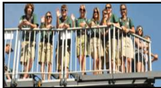
NCCC members wave hello.