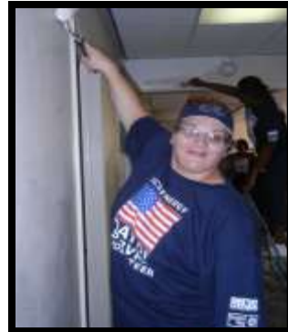
A volunteer applies a fresh coat of paint.