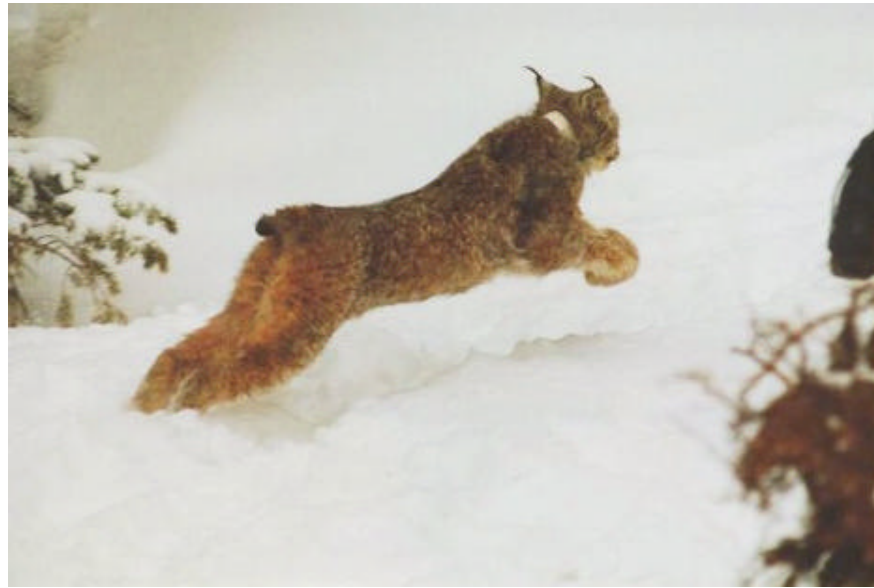
Figure 1: Photo by Jocelyn Russell