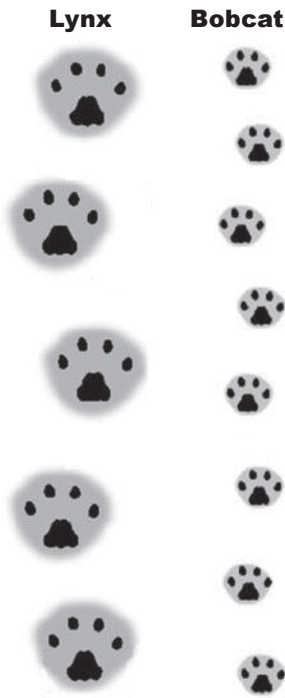
Montana FWP Tracks are shown with shaded area representing impression of hair in the snow.

Lynx tracks are approximately 3–3¾ inches long and 3½–4½ inches wide in dirt and up to 4½ inches long and 5 inches wide in snow. Bobcat tracks are approximately 1¾–2½ inches long and 1¾–2½ inches wide in dirt and up to 2½ inches long and 2¾ inches wide in snow. Both bobcats and lynx have 4 toe pads on the front and hind feet. Claw marks typically do not show as they do with canids. Because lynx have more hair on their feet, their toe pads are usually less distinct than the toe pads of bobcats.