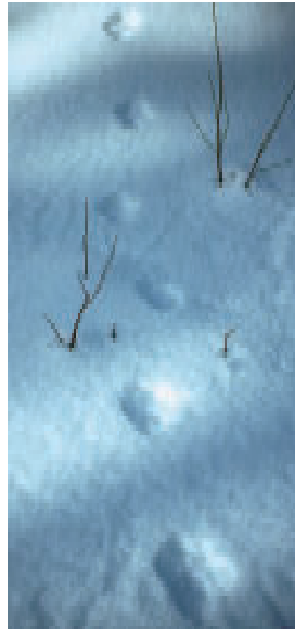
A set of lynx tracks in snow.

Lynx tracks in snow are generally less distinct than bobcat tracks and often display a powder-puff appearance as a result of abundant foot hair. In wet or compacted snow, lynx tracks sometimes display smaller toe pads than are evident in bobcat tracks. Back feet often follow in the front foot tracks of both species. When walking, the stride (distance between footprints of the same foot) is 5–16 inches for bobcats and 12–28 inches for lynx. Both bobcat and lynx track trails tend to “wander” compared with the more straight-line patterns of wild canids (foxes, coyotes,