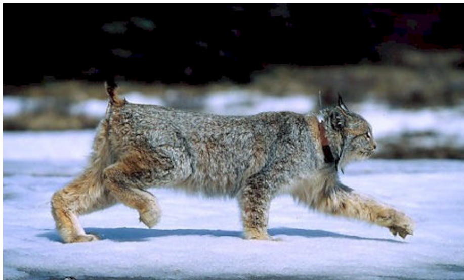
Figure 2: Photo by Mary Lloyd

Lynx released as part of the reintroduction program are fitted with radio collars. The collars are either white with silver transmitter boxes (Figure 1) or red-orange with black transmitter boxes (figure 2). However, you might trap a lynx without a radio collar. These would be animals that were not part of the reintroduction effort, reintroduced lynx that might have slipped their radio collars, or offspring of our reintroduced lynx that have not yet been captured for radio collaring. Radio collars might also be obscured by the fur of the animal.