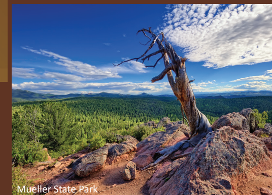
Mueller State Park