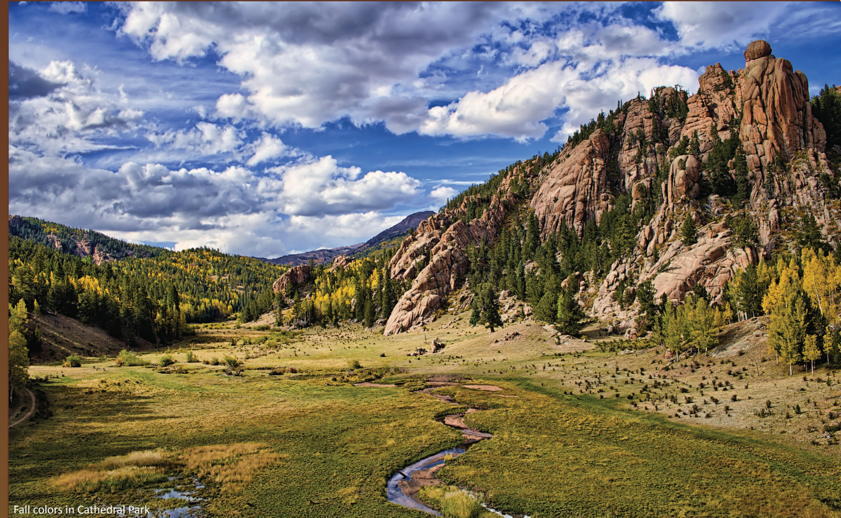
Fall colors in Cathedral Park