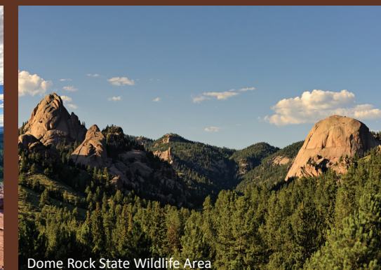
Dome Rock State Wildlife Area