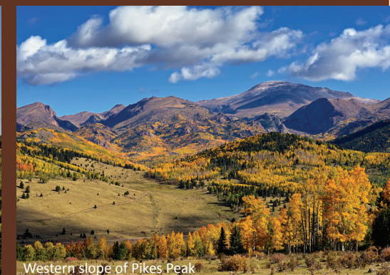
Western slope of Pikes Peak