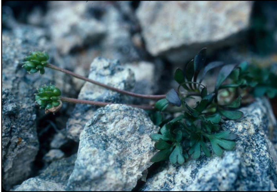
Figure 1. Close-up of Ranunculus karelinii in fruit.