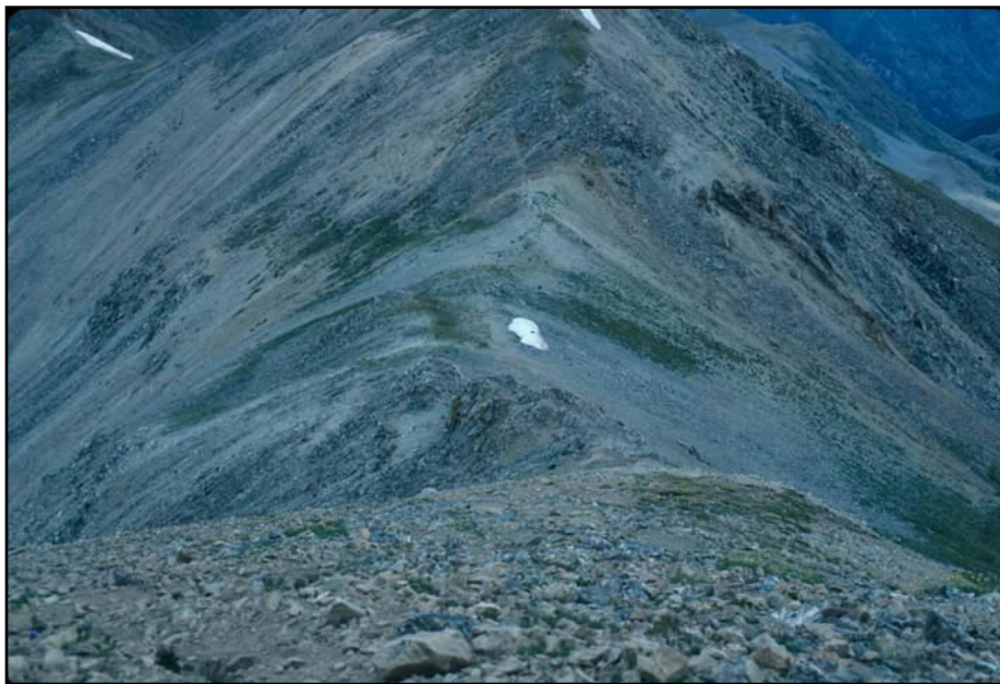
Figure 2. Ranunculus karelinii habitat on Missouri Mountain.