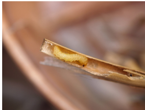
Figure 2: Sawfly larva in stub.

on wheat stems, positioned with the head pointed downward.