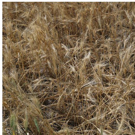
Figure 4: Lodging caused by wheat stem sawfly.

Planting attractive varieties of trap crops such as barley, oat or rye along the edge of wheat fields may be effective in decreasing damage and reducing the number of sawflies the following year. The sawflies will oviposit in the trap crop, but the larvae will be unable to complete development. This method is especially effective when sawfly abundance is low to moderate and significant infestations are limited to the field margins. However, when sawflies are abundant, females may move past the trap crop and into the wheat to oviposit, resulting in significant damage.