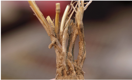
Figure 3: Stubs in which wheat stem sawfly larvae overwinter.

notch around the interior of the stem. They then seal the interior of the stem just below the notch with frass and move down near the crown. The upper stem often breaks at this weakened notch just prior to harvest, and the remaining stem containing the overwintering chamber is referred to as the 'stub' (Figure 3). The larvae overwinter in the stubs, slightly below soil level, before pupating in early spring. They produce a clear protective covering that protects them from excess moisture and moisture loss.