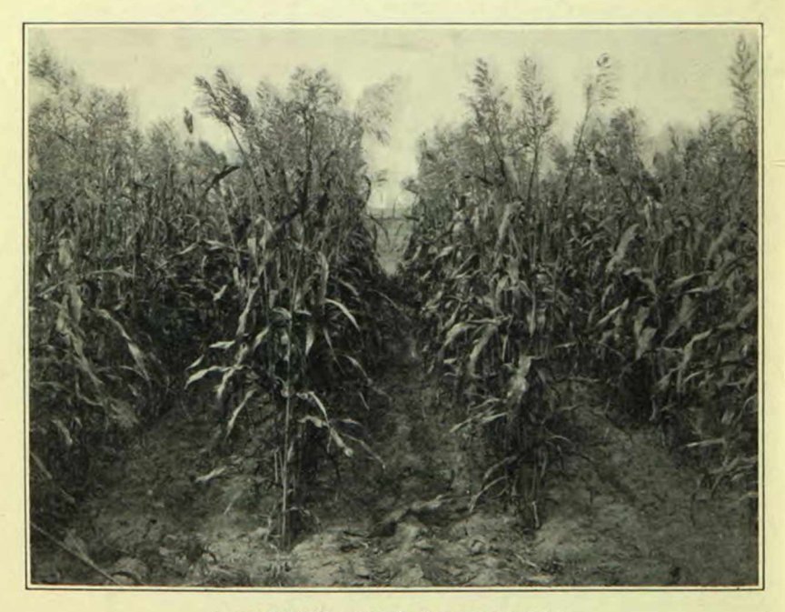
A good yield of leafy forage sorghum

Sudan Grass.—Average yields of air-dry sudan hay at the Akron Experiment Station have been 1.4 tons during a 6-year test. Sudan grass can be grown in rows or seeded broadcast in a drill with about the same yield per acre. Finer stems and