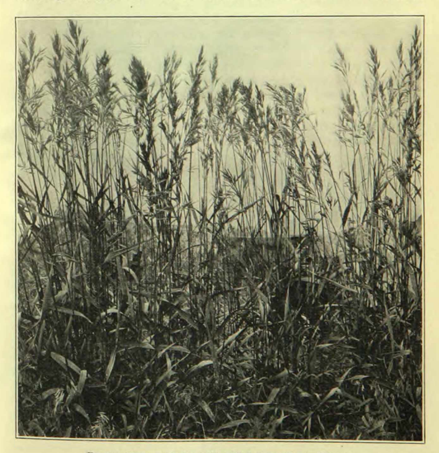
Brome grass may do well under favored conditions

Winter Rye—Sudan Grass.—Annual pastures such as the small grains and sudan grass will produce more tonnage per acre under limited rainfall than will tame or native grasses. Winter rye seeded at the rate of 40 pounds per acre as early as August 1, with reasonable moisture, should provide considerable fall and early spring pasture. Stock can be kept on the rye field until