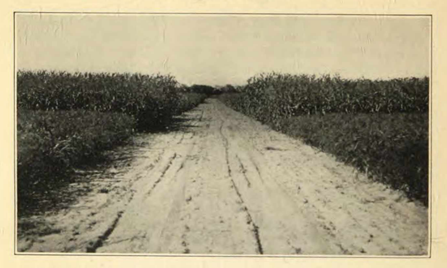
Forage and feed crops experiments at the United States Experiment Station, Akron, Colorado.

using 15 to 20 pounds of seed per acre. When a hay crop is desired, soybeans should be cut with bean cutter or mower as the pods begin to turn yellow and before the leaves begin to drop. When grown for a seed crop, the highest yields of soybeans of good quality will be secured if harvested when a majority of the pods have turned brown.