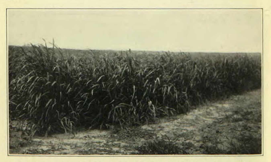
Sudan grass is excellent for pasture or a good hay corp. If cut as the first heads appear, sudan hay contains 9 to 11 percent protein and two cuttings are possible.

Sudan is a sorghum and when stunted by drouth or frost, there is some danger of prussic-acid poisoning of stock. Some stockmen seed a field of winter rye in late spring in addition to the August seeding to provide early summer feed in case the sudan is slow to start. Late spring-seeded winter rye or winter wheat will not head, except a few straggling heads some years. Therefore, considerable pasture will be available until late summer.