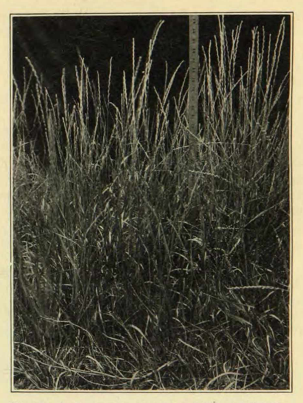
Slender wheat grass is adapted in Eastern Colorado

not seem to furnish any more pasture on a given rainfall than the native sod, and they will not survive as long a period of sustained drouth. One must decide between the annual pastures, or be willing to try, try again in seeding and reseeding the perennials until conditions appear to be best for establishing stands. Then it is necessary to be most careful in pasturing so as not to injure the grasses.