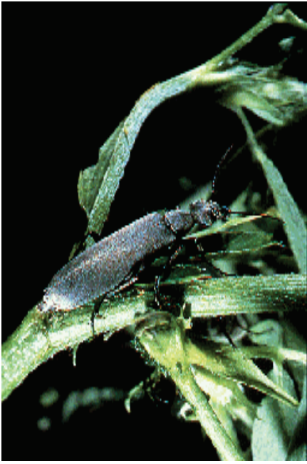
Figure 2: E. fabricii , a blister beetle common in June in Colorado.

associated with grasshopper outbreaks. Consequently, alfalfa grown near rangeland has a greater likelihood of blister beetle infestation.