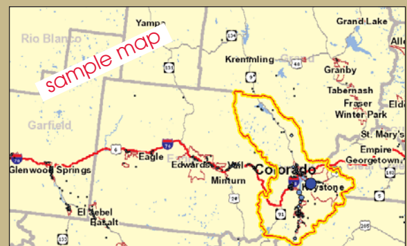
This LED map shows where people who work in Summit County live.