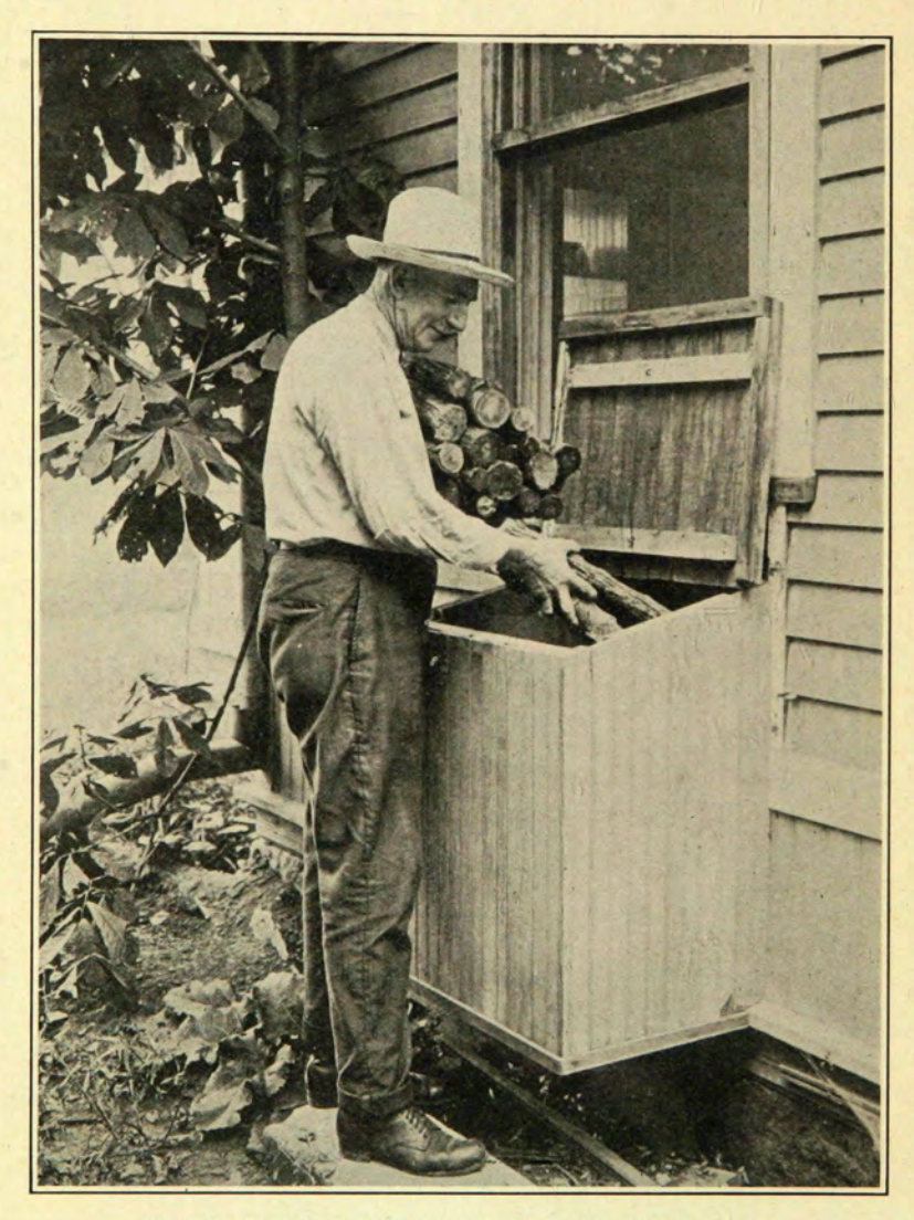
The Outside Wood Box Helps to Keep the Kitchen Tidy