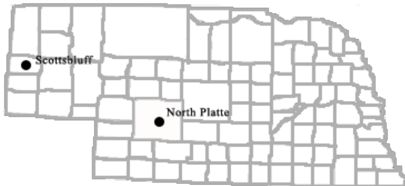
Two Nebraska Panhandle Dryland Locations