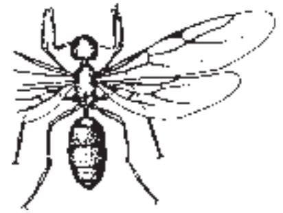
Figure 2: Winged ant.