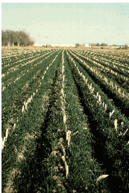
Figure 4: Corn stubble is used as cover for winter wheat seeding.

Vegetative barriers (Figure 2) can consist of perennial plants or annual plants or a combination. Taller plants provide more protection than shorter plants when used at the same spacing. For example, a barrier of tall wheatgrass 2.5 feet high will provide a stable barrier as well as reducing the unsheltered distance by 25 feet (2.5 ft. x 10).