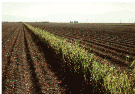
Figure 2: Vegetative barrier of sorghum in field.