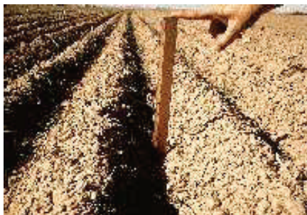
Figure 3: Ridging as an effective barrier. Here a deep furrow drill creates ideal ridges.