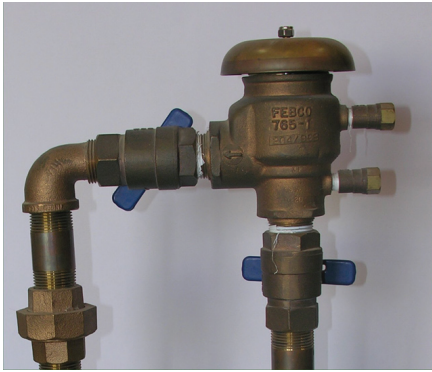
Figure 3: Pressure Vacuum Breaker