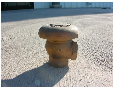
Figure 1: Atmospheric vacuum breaker.

The reduced pressure (RP) backflow device is the highest level of protection available. This device protects from backflow and back pressure. When installing the device, a minimum of 12 inches of access and clearance between the lowest portion of the device and grade, floor or platform must be provided. There must be adequate clearance around the assembly so that testing and repairs can be accomplished.