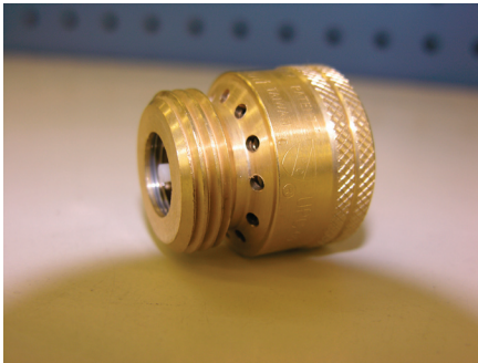
Figure 5: Hose connection vacuum breaker.