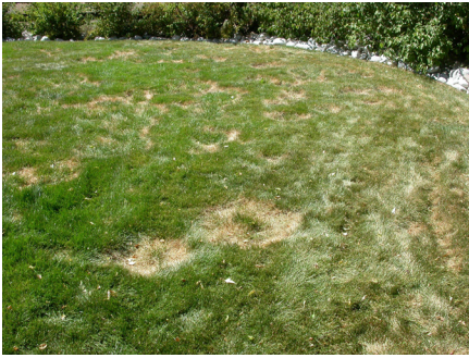
Figure 2. Ascochyta leaf blight. Note that not all of the leaves within a diseased area are blighted.