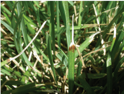
Figure 3: Bleached leaf tips and banding are characteristic of Ascochyta leaf blight.