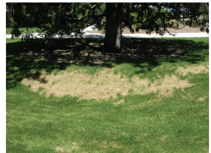
Figure 1: Ascochyta leaf blight on Kentucky bluegrass

Ascochyta species can be found on senescing or dead leaves of several turfgrass species, however the disease appears to be most serious on Kentucky bluegrass.