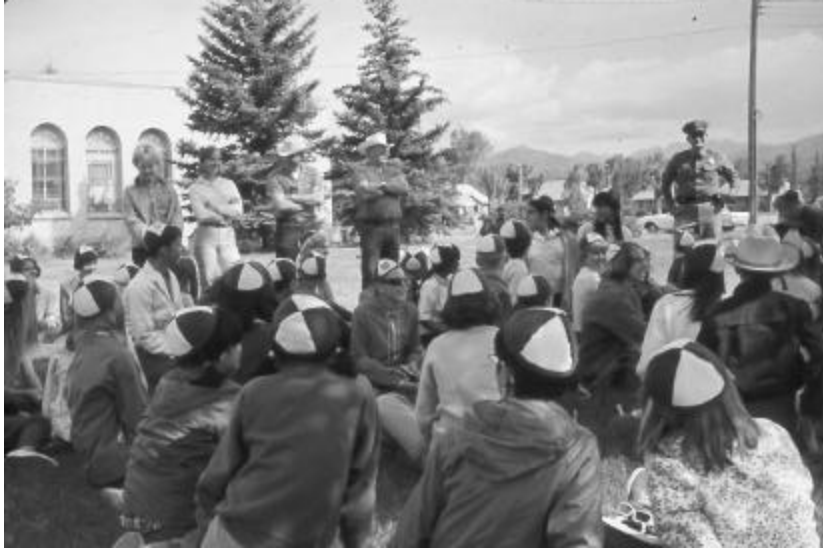
A student Field Day at the SJBRC facilities.