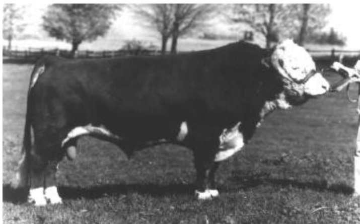
Brae Arden 5410, born 1965, 44% inbred.