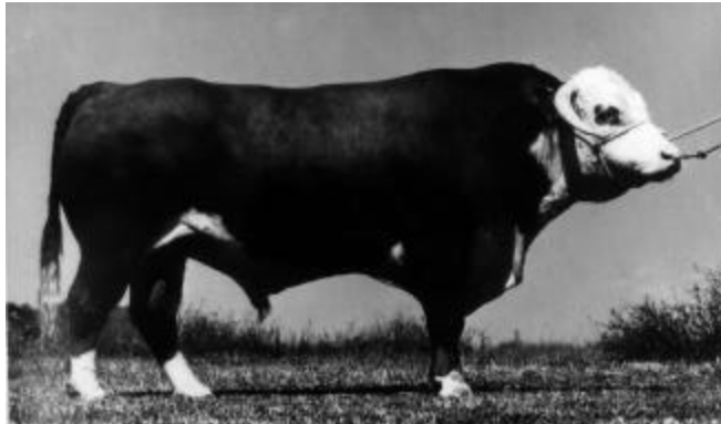
Prospector 0716, born 1970, 36% inbred.

Armstrong (1964) made an evaluation of the productivity of lines and their crosses based upon larger numbers of weaning weights and daily gains. Selection effects were discouraging. Selection differentials for bulls were about 50% on weaning weights. That is, bulls in the best