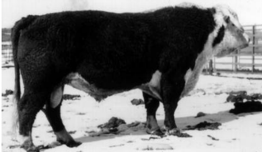
Royal 0740, born 1970, 51% inbred.