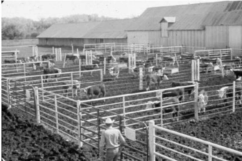
Cattle and cattle facilities at San Juan Basin Research Center.