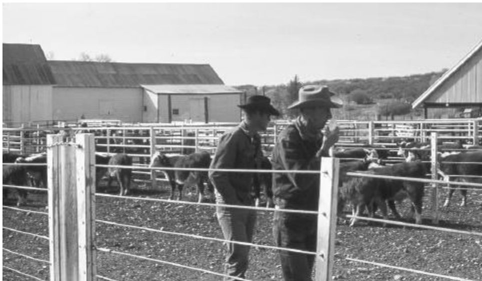
Producers viewing calf crop.