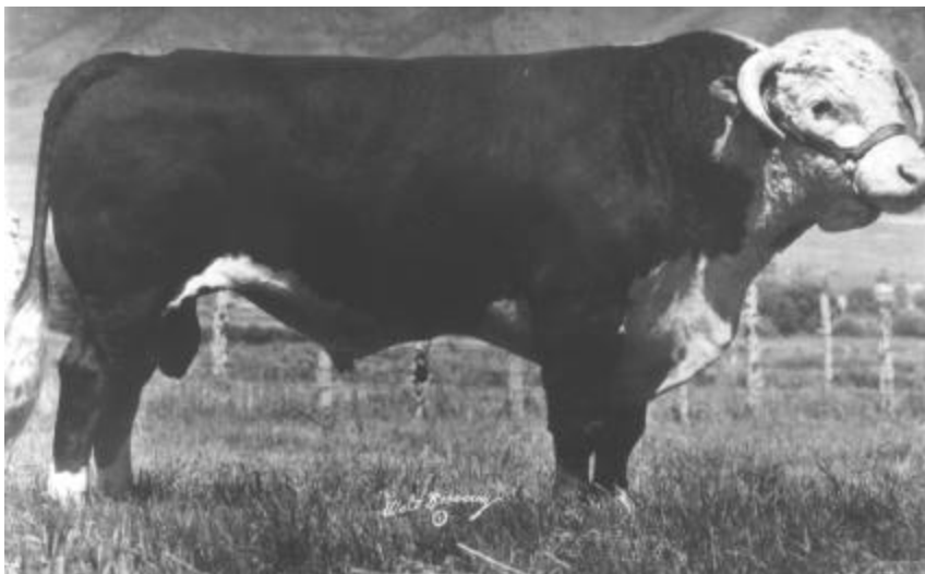
Prospector 7558, born 1967, 40% inbred.