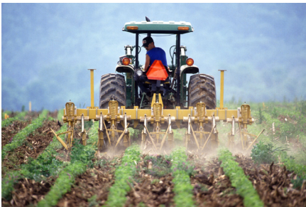
Tractors and tillage equipment must be thoroughly cleaned before being used with other crops.