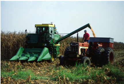
Equipment for planting and harvesting of bio-pharm crops must be dedicated to that purpose, i.e., the equipment cannot be used with any other crop.