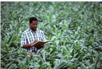
Bio-pharmed fields will be closely monitored during the growing season and in following seasons to ensure that required procedures are being followed and that volunteer plants are found and disposed of properly.

biopharmaceuticals and to minimize environmental impacts. In 2004, APHIS provided additional guidance for bio-pharm permit applicants (APHIS, 2004). For example, applicants are requested to provide details on the amount of the gene product in all plant parts, the results of allergenicity testing, and an assessment of potential toxicity to non-target organisms.