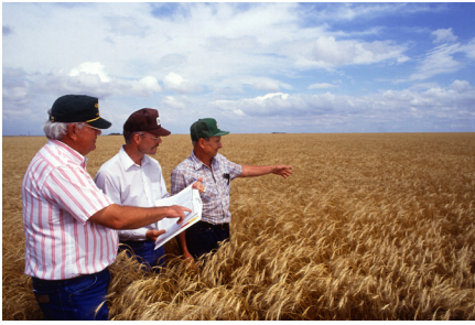
All workers involved with PMP crop production must participate annually in an APHIS-approved training program on the required procedures for growing these crops.