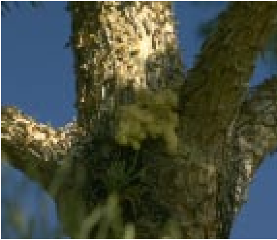
Figure 2: Popcorn-like pitch masses from Zimmerman pine moth.