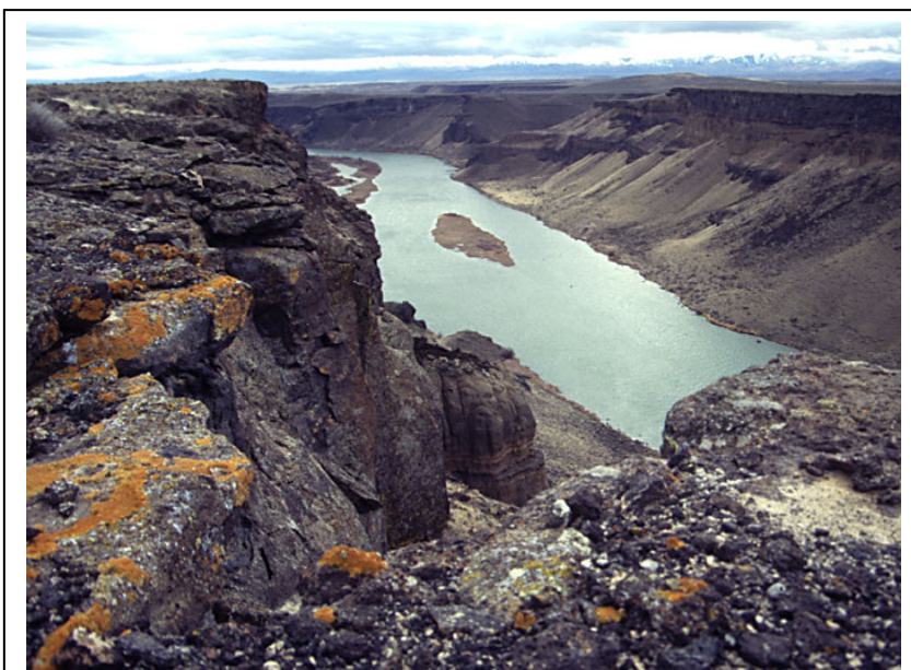
Snake River Canyon above Swan Falls.

The area was designated because it supported the greatest concentration of nesting birds of prey in North America, with about 700 raptor pairs nesting each spring. 7 A unique combination of climate, geology, soils, and vegetation create an ecosystem for raptors and their small rodent prey, 8 and, the area supported the densest ground squirrel population ever recorded. 9 In addition to the unique population of birds of prey, the area has hundreds of cultural sites, some dating back as far as 12,000 years. 10 Based on the unique population of birds of prey and the valuable cultural sites in the area it has been formally protected since 1971, though the form of this protection has changed over time. 11