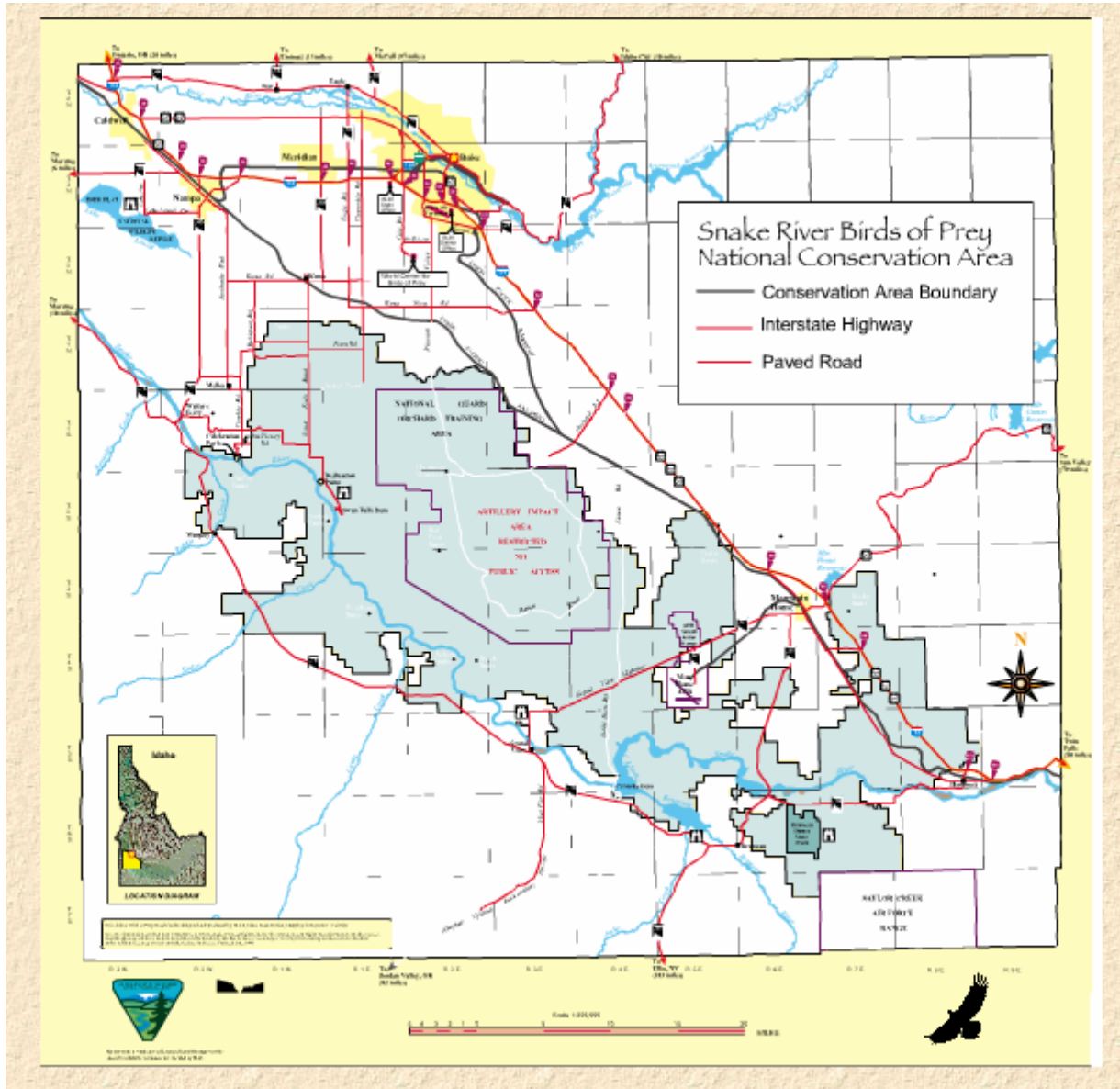
Figure 1. Map of Snake River Birds of Prey National Conservation Area