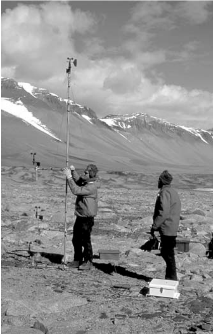
Taking wind profile measurements in Wright Valley, Antarctica.