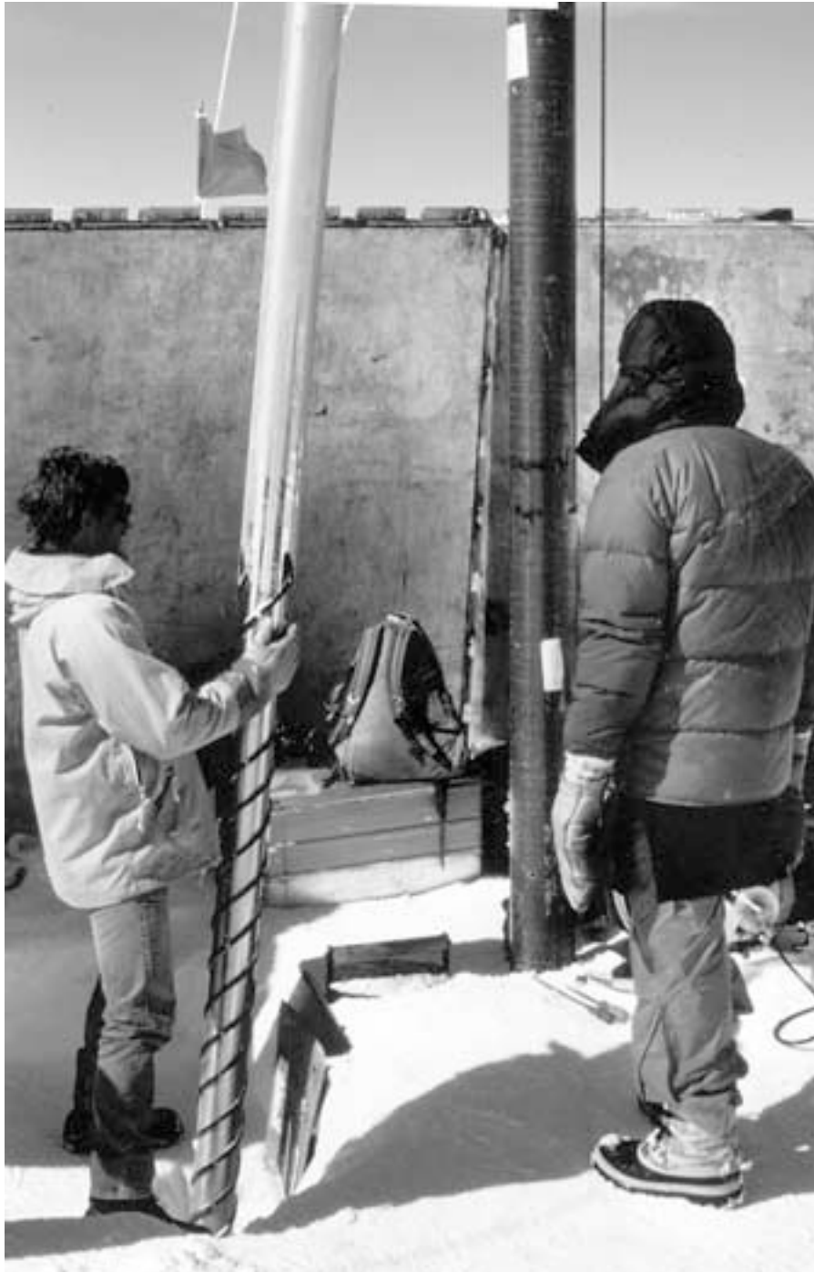
Members of the Polar Ice Coring Office (PICO) team extracting an ice core at the GISP2 site, Greenland, 1989.