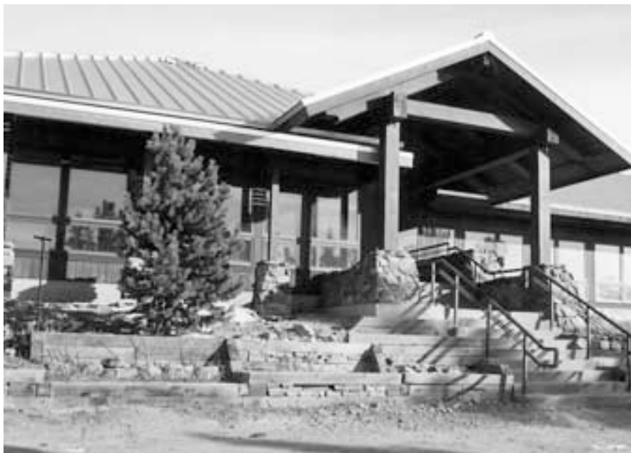
Above: Alpine Laboratory in 1963.