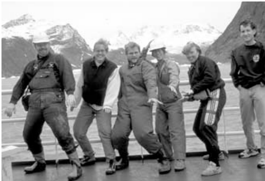
Above: Scientists from INSTAAR and the University of Tromsø on R/V Jan Mayen in Kangerlussuaq region, East Greenland, 1996.