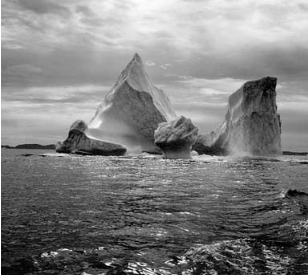
Iceberg off the coast of Laborador.