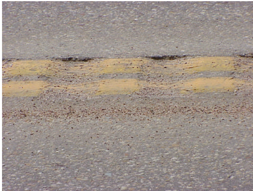
Figure 4. Sand collects in the bottoms of the rumble strip grooves.

During the winter, the grooves in the strip tend to collect some of the sand that is applied during snowstorms (Figure 4). The sand does not completely fill the grooves, however, it does obscure