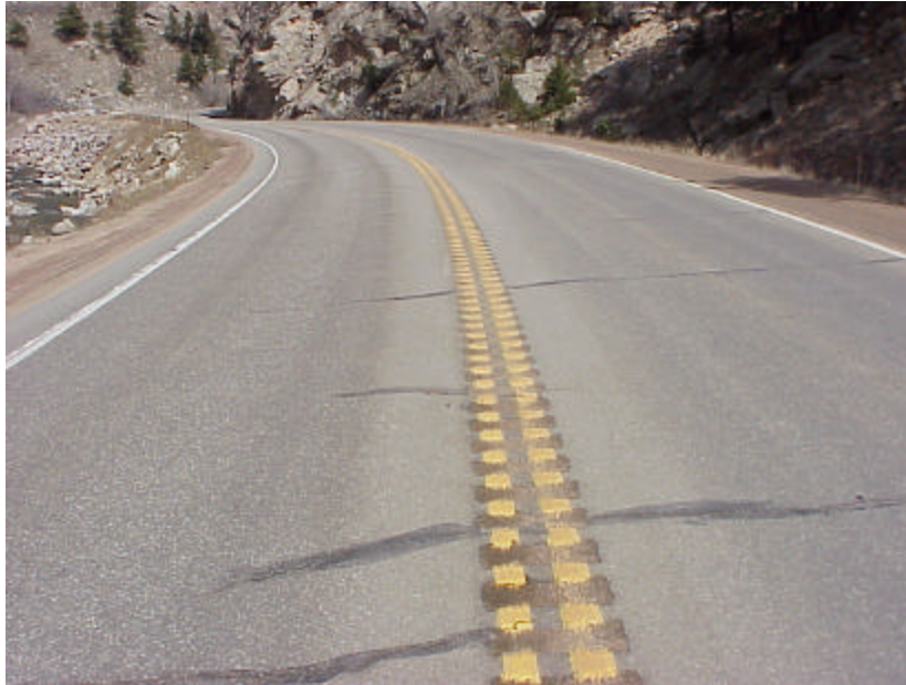
Figure 1. State Highway 119 in Boulder Canyon winds through Forest Service land.

The centerline rumble strip site is located in Boulder Canyon on SH 119 from Milepost (MP) 23, just east of Nederland, to MP 40, about two miles west of Boulder. This is a winding stretch of two-lane highway that has limited site distance and a double yellow "no passing" center stripe for most of its length (Figure 1). In the 17-mile stretch through the canyon, centerline rumble strips were placed at all no passing locations except through intersections. In areas where sufficient sight distance allowed safe passing, no rumble strip was installed.