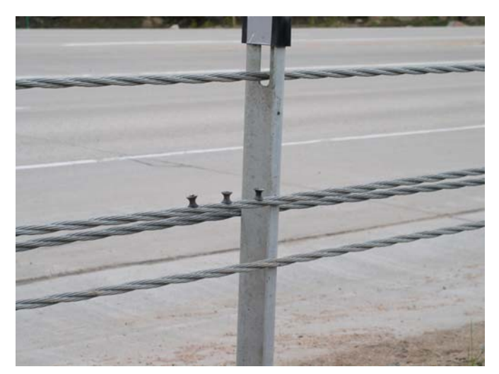
Figure 6. Cables positioned lower than design height.

It is very important that the cable height both sides of the impact point be checked whenever accident damage is being repaired. Movement of the cables during impact often causes the