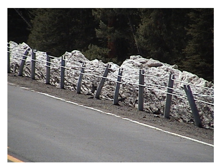
Figure 5. Posts on SH-65 are bent in all directions, suggesting that the damage is not all caused by snowplows.

Locations need to be evaluated carefully and individually to determine if cable guardrail systems are the best way to protect a hazard. An area where snow will stand over long periods in the winter and the guardrail must be positioned very near the edge of the pavement is an example of a place where the use of a cable system may be inappropriate - plowing operations tend to damage cable guardrail systems located very close to the highway (see Figure 5 ). Sections of highways where avalanches repeatedly run over the roadway would be another example of a