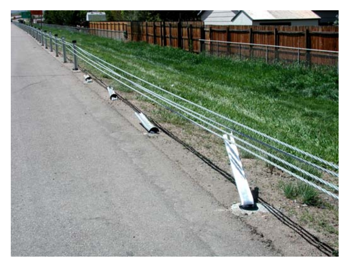
Figure 2. Only four posts were bent in this drive-away accident on US-285 at Kipling.

on US-285, Research was notified of four hits. Three of them were so minor that the impacting vehicles left without law enforcement being informed. One required replacement of 4 posts; the second, 2 posts; and the third, 3 posts. The fourth hit was more severe. It involved a CDOT engineer from Durango who credits the Brifen WRSF system with saving his life. This more severe accident required replacement of only 6 posts. None of the accidents required replacement or repair to anything other than posts and hardware such as cable locator pegs and post caps. Research has been informed of only one