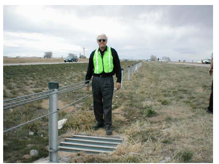
Figure 4. The cables over this drain inlet are much farther off the ground than the design specification.

The fourth accident report, dated February 11, 2004 also provides important information, but of a very different type: A 1995 Honda Accord, northbound on I-25, struck the w-beam guardrail on the right shoulder about 1/4 mile north of SH-56. It then crossed both northbound lanes and the median, went through the cable guardrail without damaging any posts or the cable, and was hit by a southbound vehicle before it continued off the highway to the west.