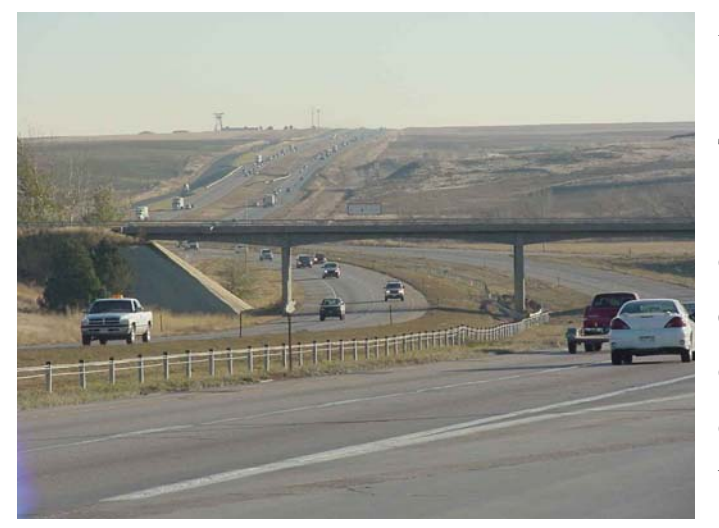
Figure 3. The I-25 – SH-56 interchange, looking south.

I-25 at SH-56: There have been several hits on the two systems in the median of I-25 at the SH-56 interchange since their installation in August of 2003. Four Colorado State Patrol Traffic