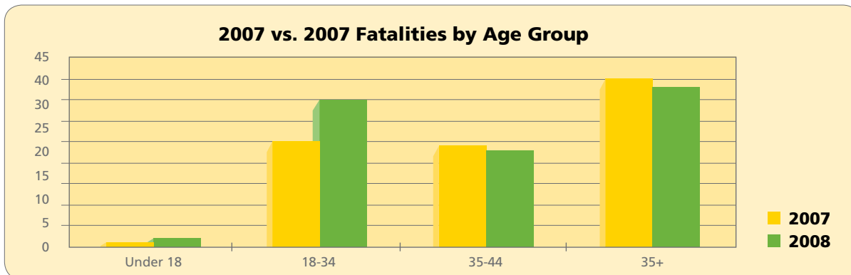
2007 vs. 2008 Fatalities by Age Group