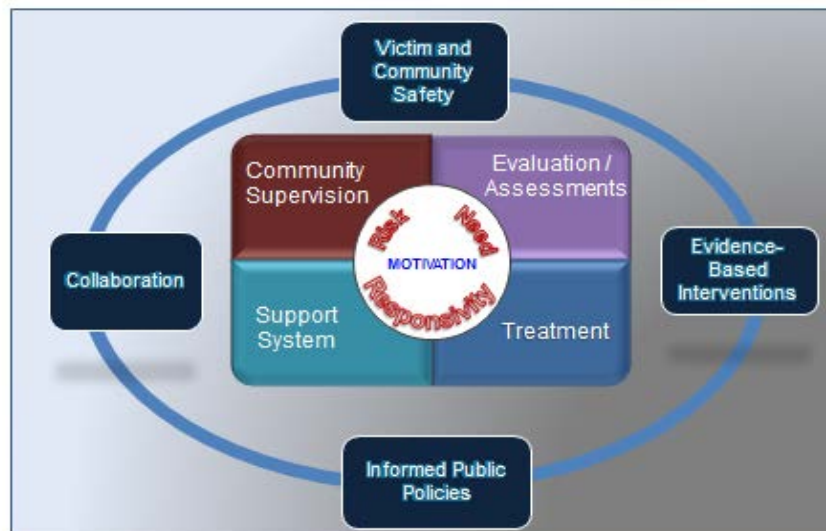
Treatment, Engagement, Assessment, Management and Supervision (TEAMS) Model

5.005 TEAMS is an acronym for Treatment, Engagement, Assessment, Management and Supervision. 122 This model guides the CST members to work collaboratively with each other to assist the client/offender in becoming a pro-social, productive member of society, and in order to enhance community safety. The foundations of the model are Victim and Community Safety, the use of Evidence Based and Research Informed Practices, Informed Public Policies and Collaboration.