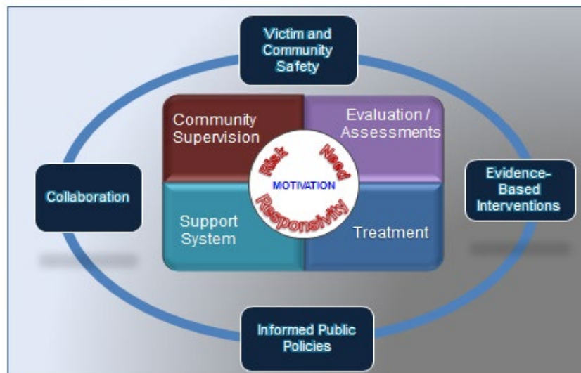
Treatment, Engagement, Assessment, Management and Supervision (TEAMS) Model

5.005 TEAMS is an acronym for Treatment, Engagement, Assessment, Management and Supervision. 115 This model guides the CST members to work collaboratively with each other to assist the client/offender in becoming a pro-social, productive member of society, and in order to enhance community safety. The foundations of the model are Victim and Community Safety, the use of Evidence Based and Research Informed Practices, Informed Public Policies and Collaboration.