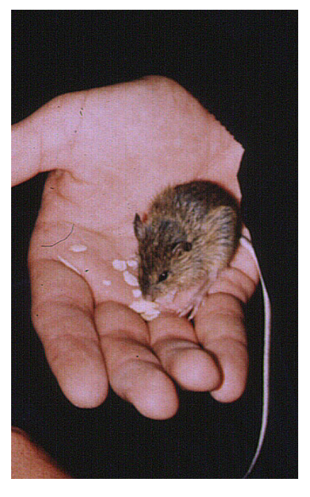
Zapus hudsonius preblei

Although the meadow jumping mouse ( Z. hudsonius ) is common and widespread across North America, the Preble's meadow jumping mouse subspecies ( Z. h. preblei ) currently occurs only in a few watersheds along Colorado's Front Range and in southeastern Wyoming. The historic abundance of PMJM is unclear. However, trapping surveys indicate that a number of historic PMJM sites are apparently no longer occupied. These sites have been disturbed and/or isolated as a result of changing land use (Ryon 1996). Evidence also suggests that the Denver metropolitan area has formed a barrier between the northern and southern extents of the PMJM range (Shenk 1998). In Colorado, PMJM is currently documented from seven counties (Weld, Larimer, Boulder, Jeff