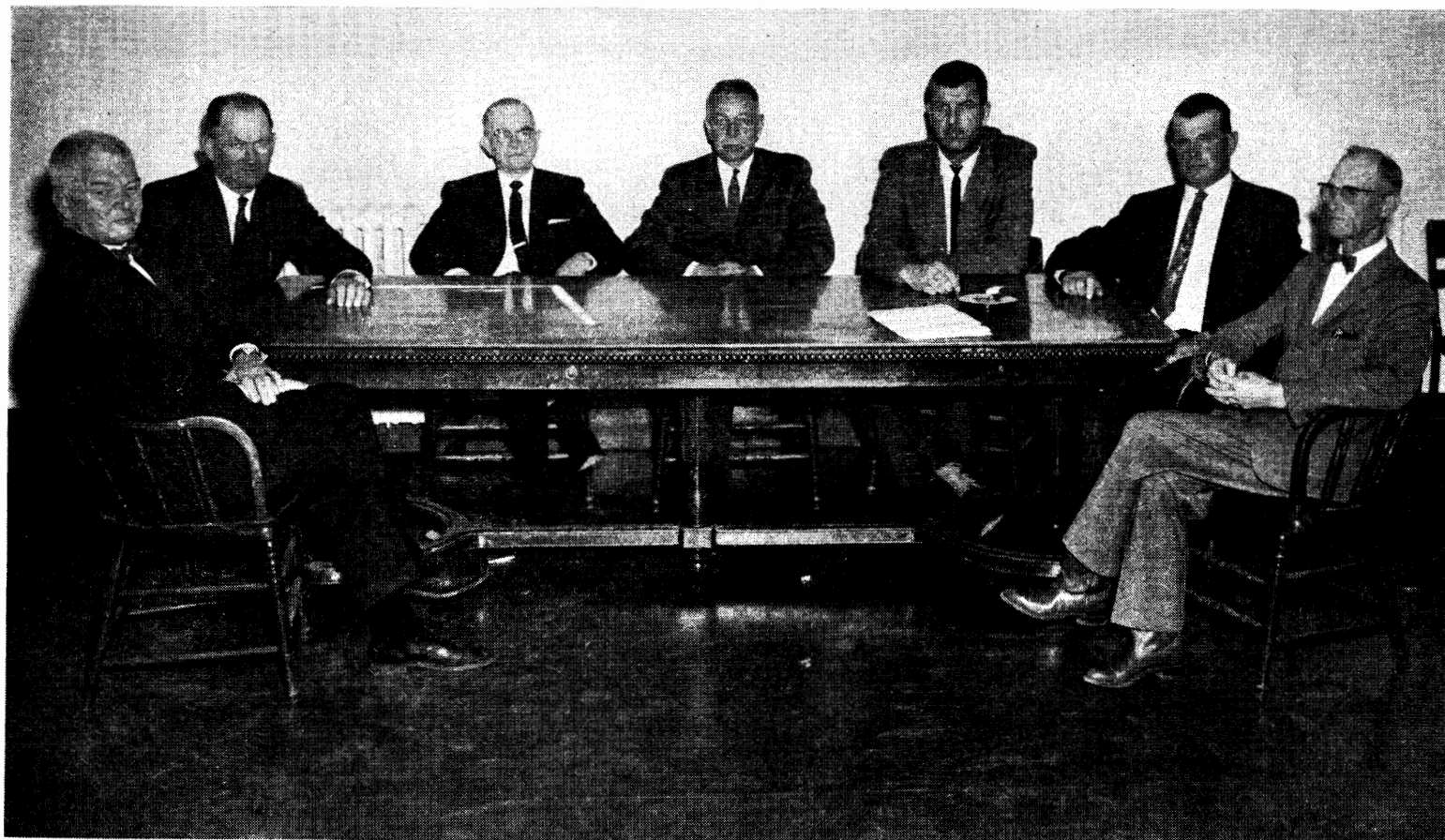
ARKANSAS RIVER COMPACT ADMINISTRATION MEETING, JULY 9, 1963.