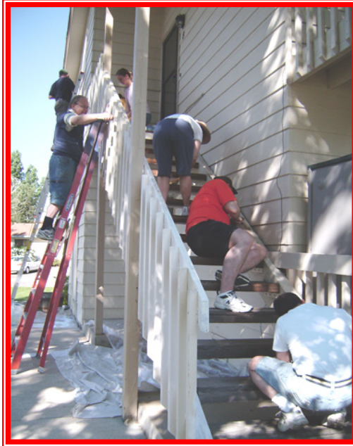
The Church of Jesus Christ of Latter-day Saints (Boulder County)

Nearly 100 members of the Boulder Colorado Stake of The Church of Jesus Christ of Latter-day Saints painted housing structures on Sat., May 12, for the Boulder County Housing Authority in Louisville and Lafayette. The volunteers completed their 2007 Colorado Cares Day project over two months ahead of the actual day of July 28.