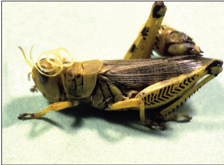
Figure 3: Mermis nigrescens , emerging from grasshopper.