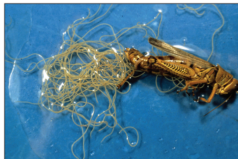
Figure 1: Grasshopper nematode, Mermis nigrescens .

In spring, tremendous numbers of eggs are laid in water in the form of long, gelatinous masses. After egg hatch, the minute first stage is free-swimming. If incidentally ingested by a susceptible insect as it drinks, the horsehair worm larva penetrates the gut and moves into the body