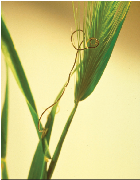
Figure 2: Mermis nigrescens , climbing.