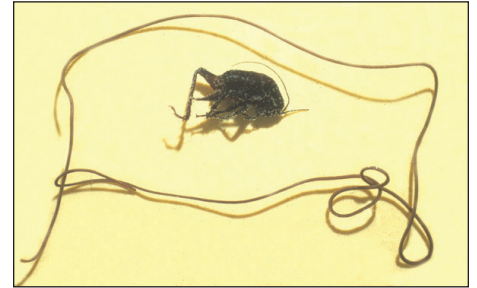
Figure 5: Horsehair worm with cricket.

Some fly larvae found in soil are worm-like, including larvae of fungus gnats and march flies. They are legless, pale to nearly translucent, but are distinguishable by having a distinct dark head.