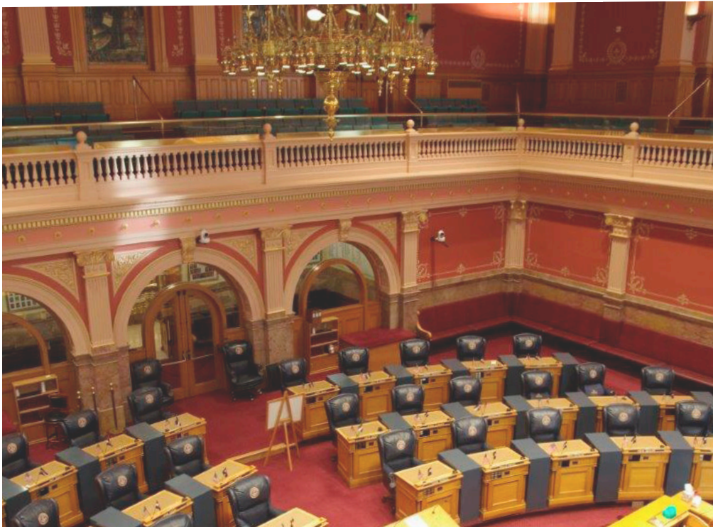
Colorado State Capitol; Senate Chamber