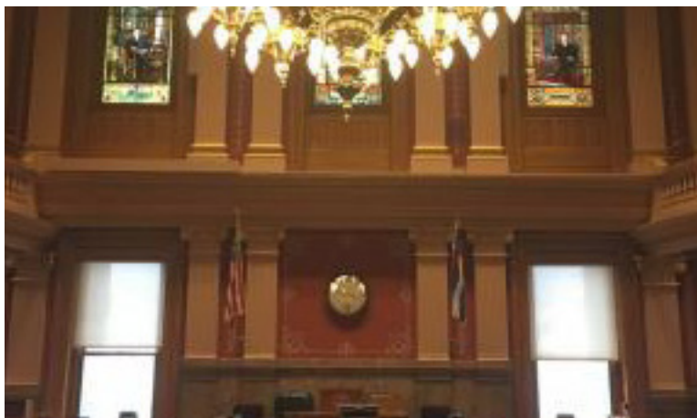
Senate Chamber; facing President lectern