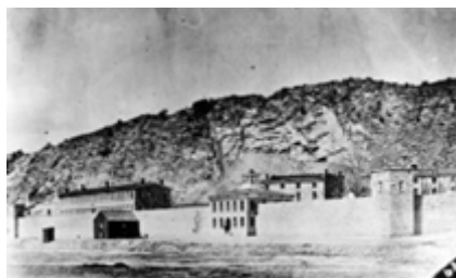
Colorado State Penitentiary; 1884