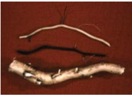
Figure 6: Top to bottom: healthy feeder root, dead feeder root, and large, perennial root.