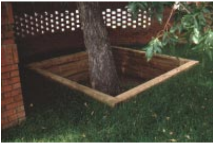
Figure 2: Tree wells cannot compensate for the addition of soil over tree roots.