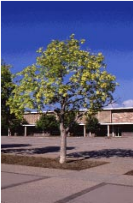
Figure 5: Yellow, chlorotic foliage from root disease.