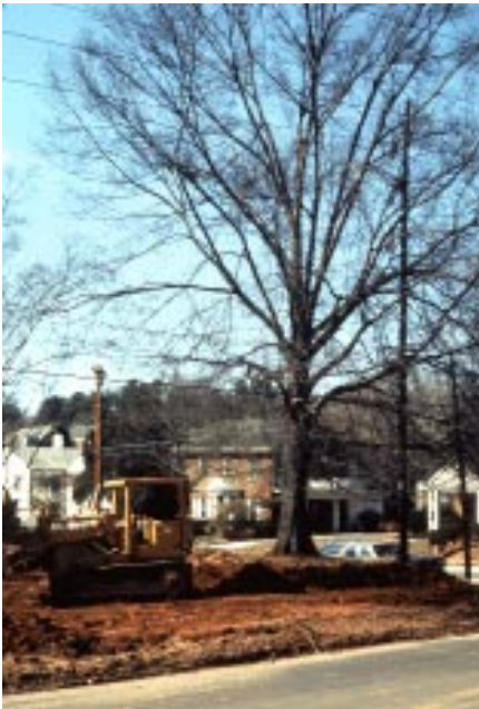
Figure 3: Root destruction, soil removal and soil compaction from construction equipment.