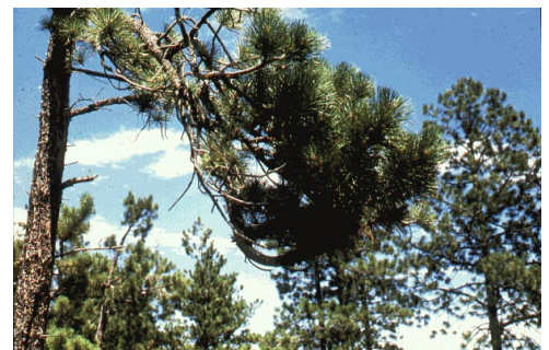
Figure 3: Witches' brooms-dense multiple branches on lodgepole pine infected with dwarf mistletoe.

Trunk infections are not as detrimental as branch infections so their removal is not necessary. Buffer zones (50 feet wide) can be cut or formed with resistant trees between infected trees and healthy trees if space allows. Contact a professional