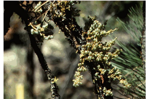
Figure 1: Ponderosa pine dwarf mistletoe plants, note thick, brown shoots.

A measure of infection severity is based on the following rating scale. A tree’s crown is divided into thirds and each third is rated. If less than 50 percent of the branches are infected in that third – the rating is 1, and if more than 50 percent are infected, it equals 2. If there are no visible infections that third of the crown gets a 0. Add the rating of each third to get a total rating (Table 1). All management recommendations and longevity information is based on this dwarf mistletoe rating.