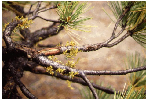
Figure 2: Lodgepole pine dwarf mistletoe plants-note thin, green-yellow shoots.

2 Infection severity based on the following: light= a rating of 2 or 3; moderate= a rating of 4 or 5; heavy= a rating of 6.