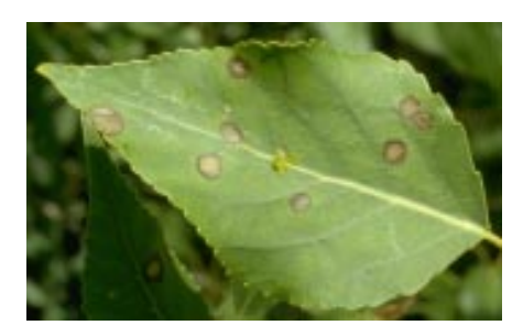
Figure 3: Septoria leaf spot showing tan circular spots.