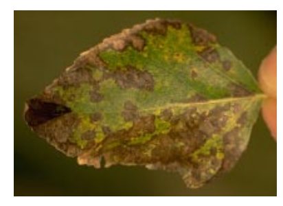
Figure 4: Septoria leaf spot showing irregular brown to black spots.

margins and small black pimples in the center (Figure 3), and irregular brown to black spots that coalesce into large areas (Figure 4).