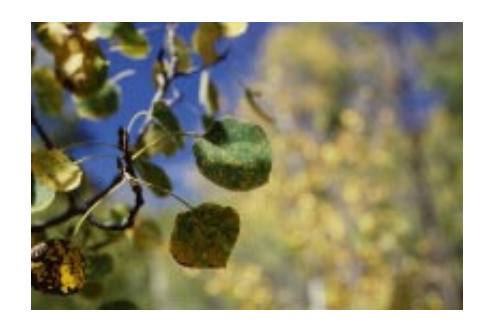
Figure 8: Rust on aspen with yellow discoloration.