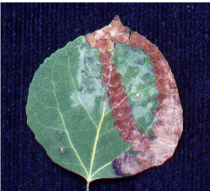
Figure 5: Ink spot disease on aspen in early summer.

weather (70 to 75 degrees F), the fungus produces microscopic spores that are carried by the wind and infect emerging leaves. Early infections are rarely serious. If the weather remains favorable, spores from these infections can cause a widespread secondary infection. Heavy secondary infections become visible later in the growing season and cause premature leaf loss on infected trees.