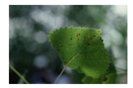
Figure 1: Marssonina leaf spot on aspen.

Marssonina survives the winter on fallen leaves that were infected the previous year (Figure 9). With spring and warmer, wet weather, the fungus produces microscopic "seeds" or spores that are carried by the wind and infect emerging leaves. Early infections are rarely serious, but if the weather remains favorable, spores