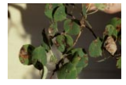
Figure 2: Marssonina leaf spot on aspen, late symptoms.

from these infections can cause a widespread secondary infection. Heavy secondary infections become visible later in the growing season and cause premature leaf loss on infected trees.