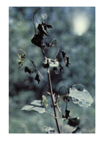
Figure 7: Shoot blight on aspen showing black and curled stem.

The leaf and shoot blight fungus survives the winter mainly on shoots infected the previous season. Spores are windblown early in the season and infect newly expanding leaves and shoots. As the season progresses, uninfected tissue becomes more resistant to the disease.