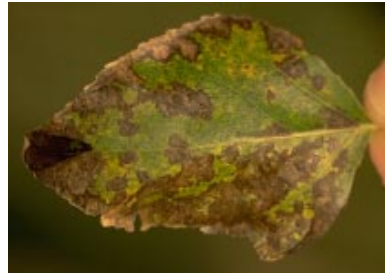
Figure 4: Septoria leaf spot showing irregular brown to black spots.

margins and small black pimples in the center (Figure 3), and irregular brown to black spots that coalesce into large areas (Figure 4).