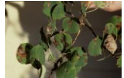
Figure 2: Marssonina leaf spot on aspen, late symptoms.