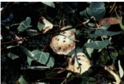
Figure 6: Ink spot disease on aspen in midsummer.

The hard fungal tissue masses that fall from infected leaves are the overwintering stage of the fungus. Wet spring weather stimulates spore production. Spores are blown and splashed from the ground to developing leaves.