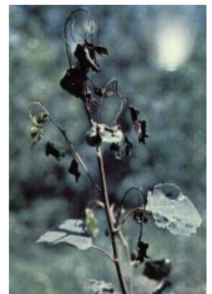
Figure 7: Shoot blight on aspen showing black and curled stem.

The leaf and shoot blight fungus survives the winter mainly on shoots infected the previous season. Spores are windblown early in the season and infect newly expanding leaves and shoots. As the season progresses, uninfected tissue becomes more resistant to the disease.