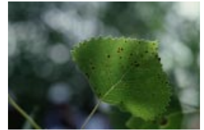
Figure 1: Marssonina leaf spot on aspen.

Marssonina survives the winter on fallen leaves that were infected the previous year (Figure 9). With spring and warmer, wet weather, the fungus produces microscopic "seeds" or spores that are carried by the wind and infect emerging leaves. Early infections are rarely serious, but if the weather remains favorable, spores from these infections can cause a widespread secondary infection. Heavy secondary infections become visible later in the growing season and cause premature leaf loss on infected trees.