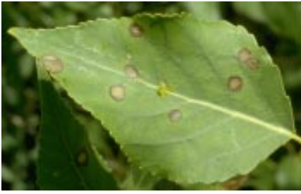
Figure 3: Septoria leaf spot showing tan circular spots.