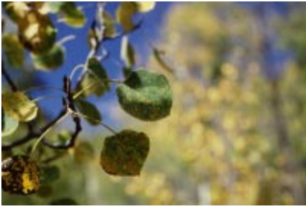
Figure 8: Rust on aspen with yellow discoloration.