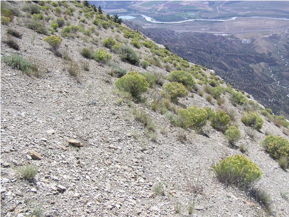
Habitat of Roan Cliffs blazing star ( Nuttalia chrysantha ) by Jill Handwerk

Habitat description: Known only from steep, shaley talus slopes derived from the Parachute Creek Member of the Green River Formation (Holmgren and Holmgren 2002, Reveal 2002). The plants are commonly associated with Gambel oak, western chokecherry, mountain mahogany and Utah juniper (Reveal 2002).