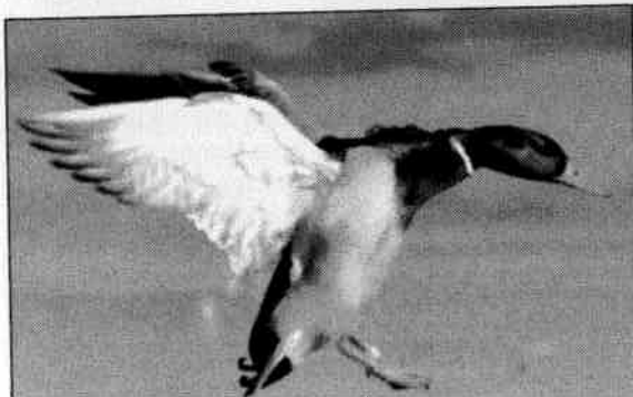
NEAL & MARY JANE NISHLER

To ensure that you aren't responsible for these types of injuries, please pack your trash and dispose of it properly.