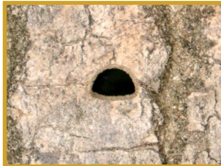
Figure 19. D-shaped exit holes can indicate the presence of EAB.