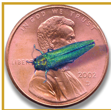
Figure 8. Adult beetles can fly approximately a half-mile to infest a new tree.