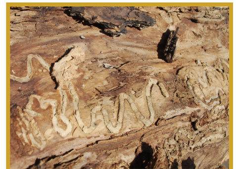
Figure 22. S-shaped tunnels or galleries can be found under the bark of an infested ash tree.