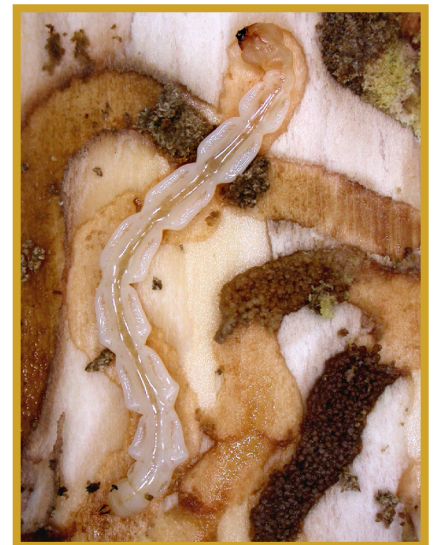
Figure 7. Emerald ash borer larva.