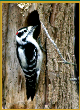
Figure 18. Woodpeckers are an important predator of EAB.