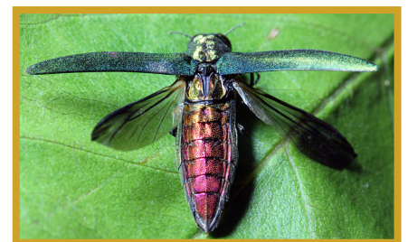
Figure 9. EAB adults have an emerald-green head/back and a coppery reddish-purple abdomen. Photo: David Cappaert, Michigan State University*