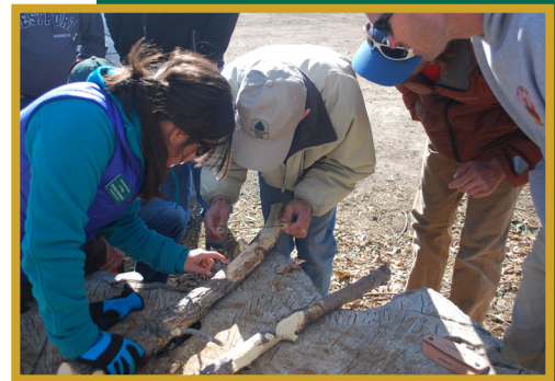
Figure 23. A CSFS forester and CSU Extension specialist assess the branch of an ash tree to determine the presence of EAB.

The decision to chemically treat individual ash trees is a personal preference, and consumers should educate themselves and use caution when purchasing products that claim to protect trees against the pest. Homeowners may opt to periodically apply insecticide treatments to help protect high-value trees; however, the early presence of EAB in Colorado may not warrant immediate preventive treatments in communities where EAB has not been detected. The closer ash trees are to an area of known infestation, the higher the risk that they will become infested by EAB through natural spread. Also, trees within or near the EAB Quarantine area are at a higher risk of infestation through human-assisted spread of the pest, because infested