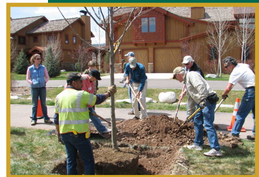
Figure 24. Planning for tree replacement is an effective management strategy for EAB.