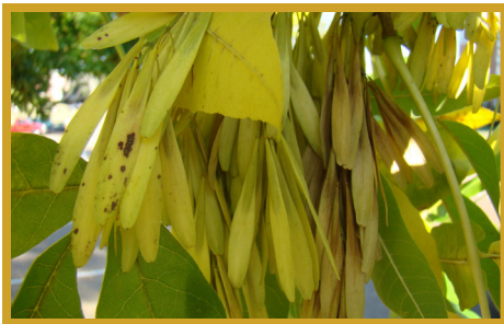
Figure 13. Seeds on ash trees are paddle-shaped.