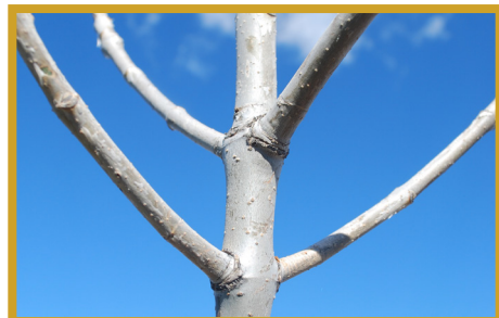
Figure 15. Branches and buds on ash trees grow in pairs, directly opposite from each other.