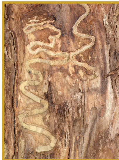
Figure 6. S-shaped emerald ash borer galleries under the bark.

Insects commonly mistaken for EAB include other metallic wood borers and the flatheaded appletree borer. Also, lilac/ash borer exit holes can be mistaken for those left by EAB.