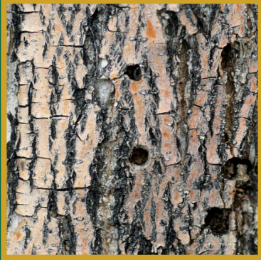
Figure 3. When lilac/ash borers exit an ash tree, they create irregular round holes.