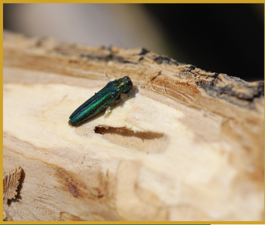
Figure 16. EAB is responsible for the death or decline of tens of millions of ash trees in at least 25 states.

If an ash tree is experiencing dieback or appears unhealthy, have it examined by a professional. Landowners that suspect the presence of EAB in their ash trees should contact the Colorado Department of Agriculture (CDA) at (888) 248-5535 or send an email to CAPS.program@state.co.us .