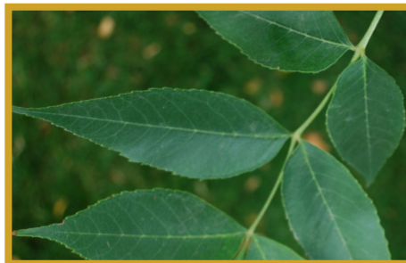
Figure 14. Ash leaves can either have smooth or finely toothed edges.