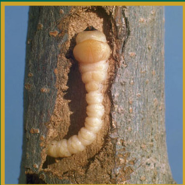
Figure 5. Dead and dying branches on ash trees may be infested with the flatheaded appletree borer.