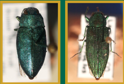
Figure 4. Several metallic green beetles are native to Colorado, including Phaenops gentilis (left) and Buprestis langii (right), both associated with declining or recently killed conifers.