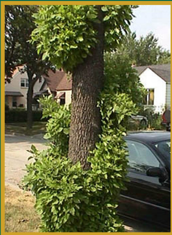
Figure 17. New sprouts grow on the lower trunk of an ash tree infested with EAB.