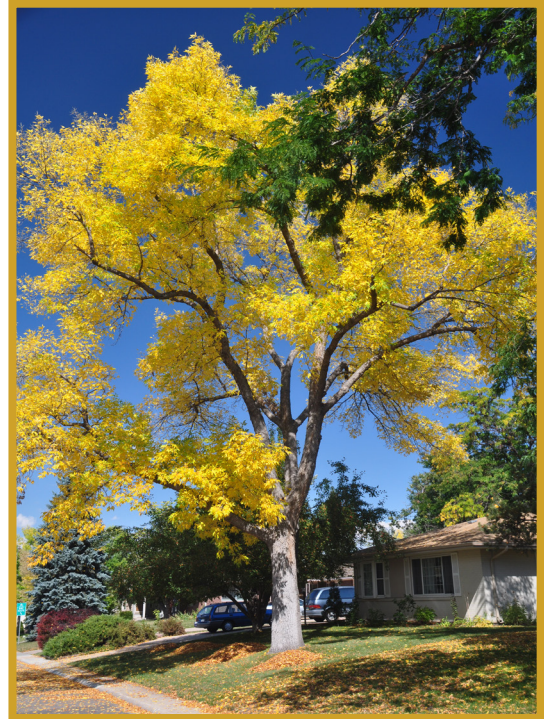
Figure 10. Ash trees have been planted extensively in Colorado over the last 50 years because they grow quickly and can tolerate the growing conditions in urban areas.

A video on ash tree identification is available at www.csfs.colostate.edu/emerald-ash-borer .