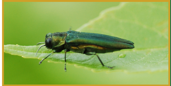
Figure 1. Adult emerald ash borers are approximately 1/2-inch long.

The emerald ash borer (EAB), Agrilus planipennis , is an exotic insect responsible for the death or decline of tens of millions of ash trees throughout the eastern United States and Canada. Native to Asia, the first detection of the beetle in the U.S. occurred in southeastern Michigan in 2002, most likely arriving in the 1990s, hidden in wood-packing materials commonly used for shipping. EAB already has cost impacted communities billions of dollars to treat, remove and replace ash trees. Infestations are difficult to detect, as the larvae reside under the bark, the adults generally are only present from May through September, and ash trees may be infested for up to four years before there are visible signs of decline.