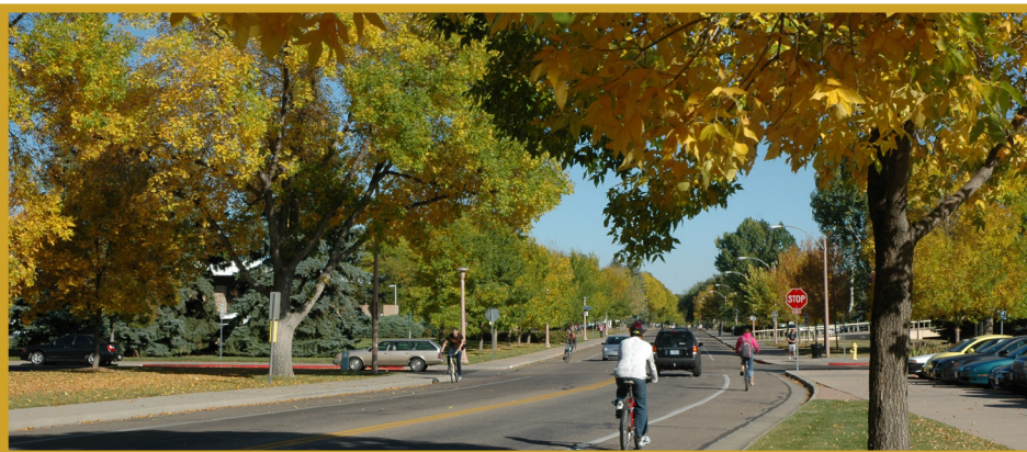
Figure 2. Ash trees comprise an estimated 15 percent to 20 percent of all trees in Colorado cities, neighborhoods, parks and backyards.

In Colorado, EAB was detected for the first time in 2013 in the City of Boulder. As a non-native insect, EAB has no native predators to keep populations in check, and threatens all true ash species ( Fraxinus spp.). As a result, the beetle poses a serious threat to Colorado's urban forests, where ash trees comprise an estimated 15 percent to 20 percent of all trees; the Metro Denver area alone has an estimated 1.45 million ash trees. Green and white ash, including 'Autumn Purple' ash and other varieties, have been widely planted in Colorado due to their fast growth, ability to tolerate urban growing conditions and high aesthetic value. Many of the state's ash trees are located on private property and in parks and other community areas. The future costs of EAB in Colorado, in terms of ash tree treatments, removals and replacements, could exceed 1 billion dollars.