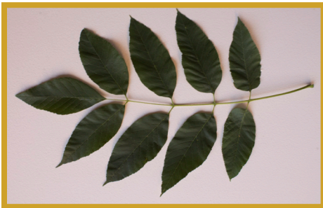
Figure 11. Ash trees have five to nine leaflets on each stalk.