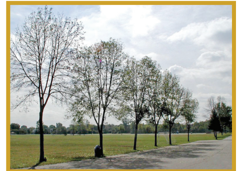
Figure 20. Ash trees may be infested with EAB for up to four years before signs of decline are visible.