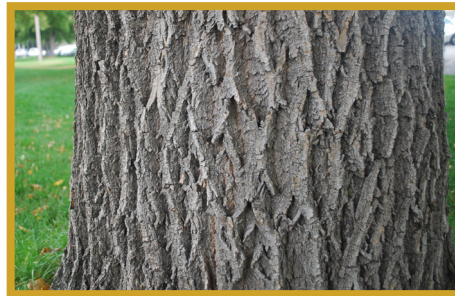
Figure 12. The bark on mature ash trees has diamond-shaped ridges.