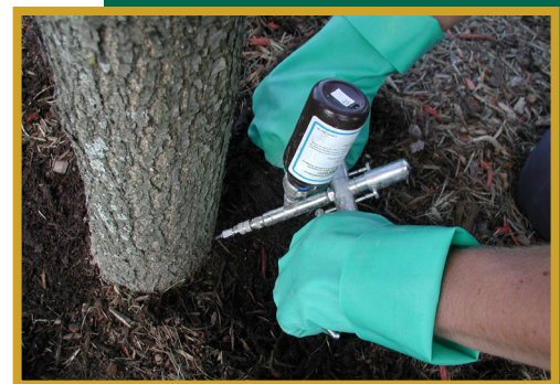
Figure 25. A syringe-like applicator is used to inject imidacloprid to control EAB.