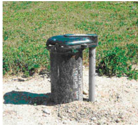
Figure 1: A properly cased and sealed well protects water quality.

Bacteria are microscopic organisms that are found nearly everywhere. Most bacteria are harmless, but certain types can cause disease, sickness or other problems. Wells used for drinking water should be tested for the presence of coliform every one to two years, in addition to other water quality parameters. Non-disease causing iron bacteria can affect household and irrigation wells. Iron bacteria causes plumbing fittings and laundry to stain and, in severe cases, clogs well screens. Chlorination is the most common method for disinfecting contaminated wells. In some cases, replacing the well cap, casing and seal may be necessary to keep the well clean after it is disinfected. Repairing the household septic system may also be necessary.