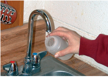
Figure 2: Sampling at the tap for bacteria in well water.