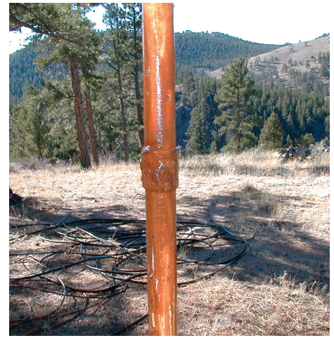
Figure 3: Iron bacterial slime on metal pipe joints.

After the chlorine is poured into the well, pour about 50 gallons of clean water into the same access hole so the metal parts are washed off to prevent corrosion. Wash tools and exposed skin parts, such as arms and face. Allow the chlorine solution to remain undisturbed for two to four hours. Start the pump and surge the well briskly by pumping the water up to the discharge pipe, shutting down the power unit, and allowing the water to fall back into the well. Surge the well in this manner three to four times at 4- to 6-hour intervals. After 18 to 24 hours, the water in the well can be purged.